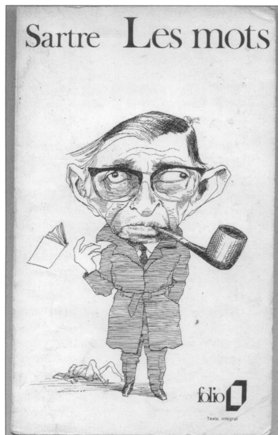
Fig. 1. Jean-Paul Sartre, Les mots (Paris: Gallimard-Folio, 1983 [1964]).

– i.e. Cabiria , 1913), and the specific cinemas visited (the Panthéon, the Kinérama, the Gaumont Palace). This historian may also discuss issues around dating, through a peculiar figure of belatedness that marks the passage. Sartre, famously, reads the age of the cinema against his own: