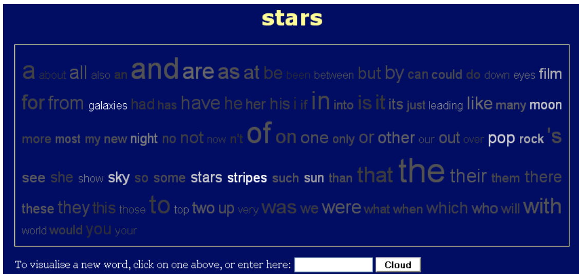
Figure 1. Collocate Cloud of node word 'stars'

http://www.scottishcorpus.ac.uk/corpus/bnc/collocatecloud.php?word=stars (accessed 1 November 2010)