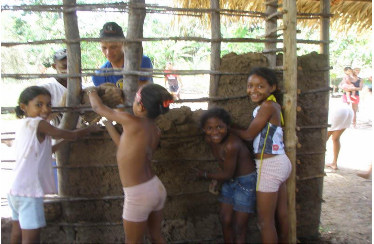
Figure 17: communal building of Beckenbauer's house in Guanabara