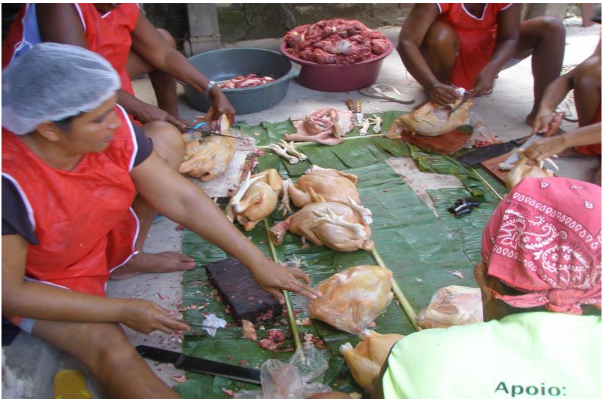
Figure 13: Women chopping meat before the festa of Divino Espirito Santo.