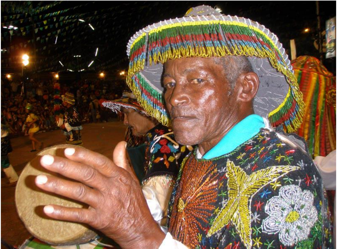
Figure 8: Drummer of a boi group during presentation in Santo-Amaro