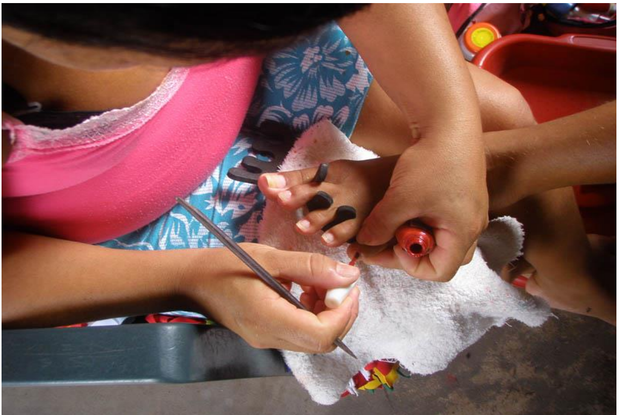
Figure 11: Girls painting nails in Guanabara.