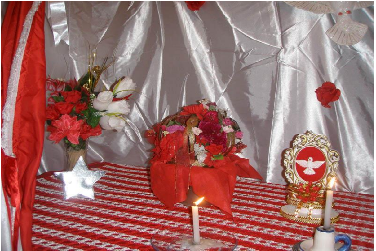
Figure 12: The crown of Divino Espirito Santo on the altar in Guanabara.