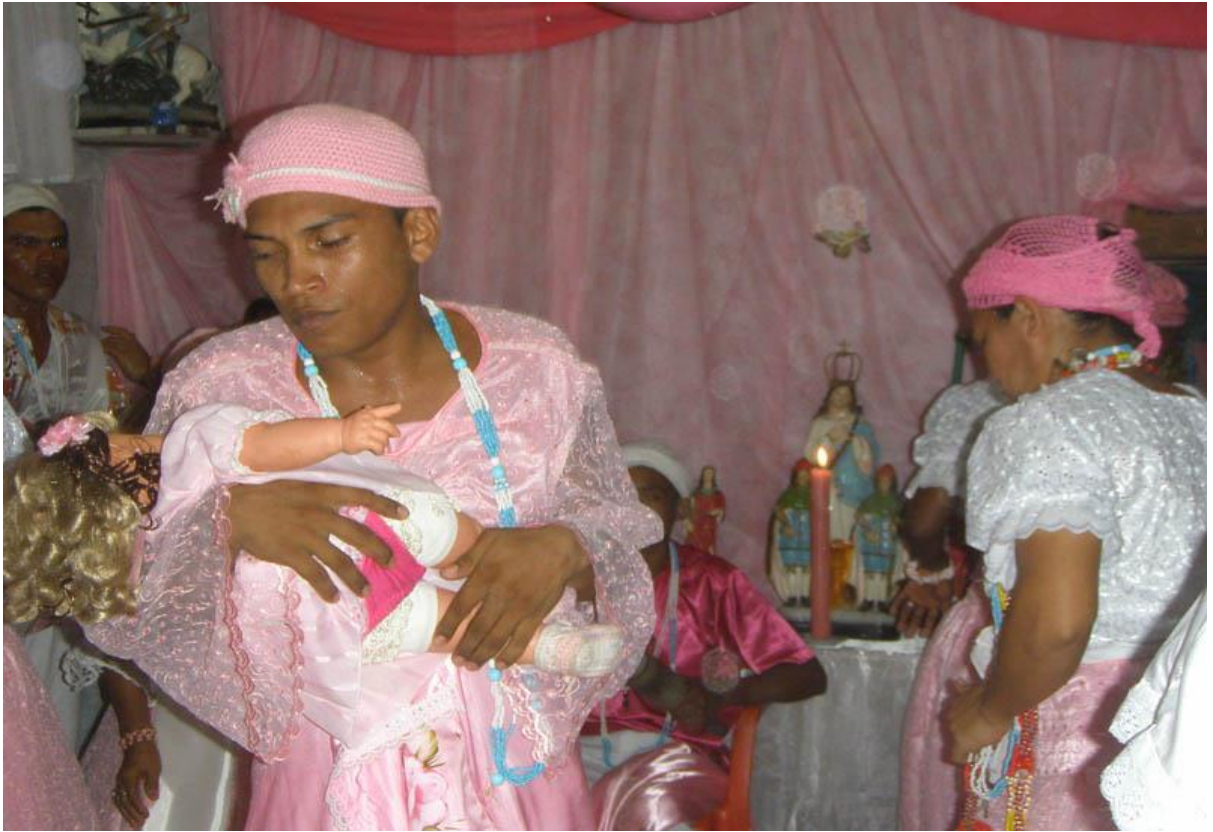
Figure 14: Pai de Santo Carlos possessed by a caboclo during a session in the terreiro.