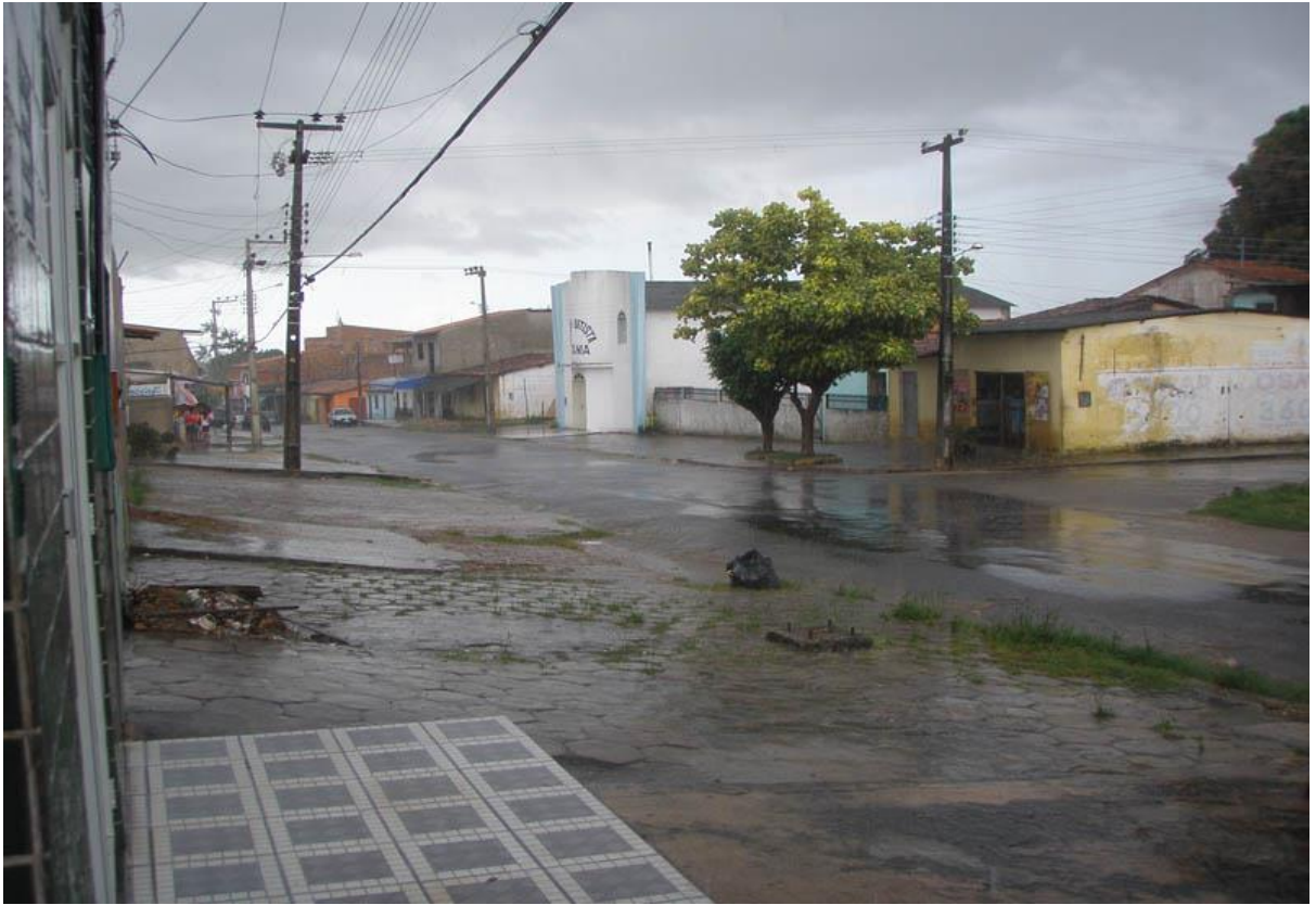
Figure 10: Santo-Amaro, São Luís de Maranhão.