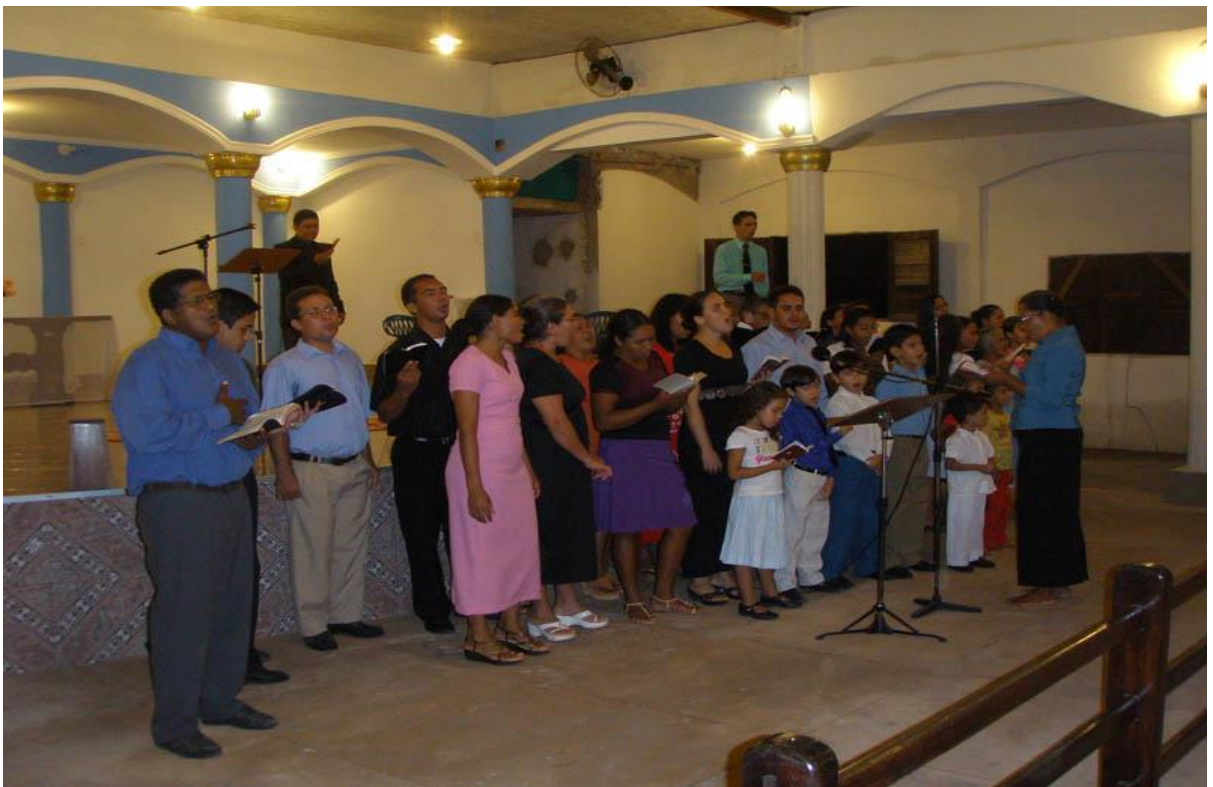
Figure 15: Chorus singing during a culto in an Evangelical Church in São Luís.