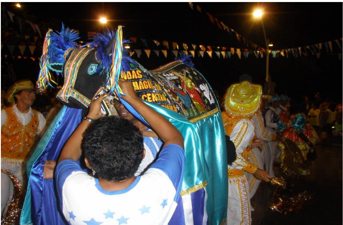
Figure 9: Boi during a Bumba meu Boi Celebration