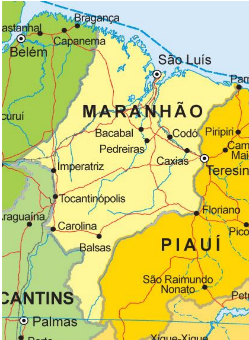
Figure 6: Map of Maranhão.