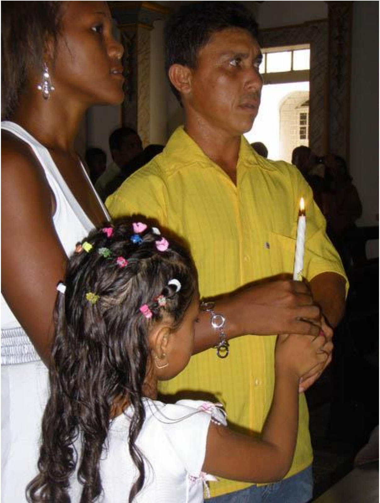
Figure 16: Mâmi in her baptism with her padrinho and madrinha .