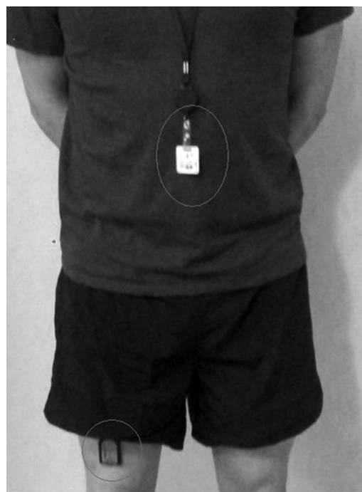
Figure 2 ActivPal accelerometer and radiofrequency identification tracking system to be worn by participants.

Participants taking part in objective monitoring will be asked to wear the ActivPal ( http://www.paltech.plus.com ; figure 2) all day every day (including during sleep and bathing) for five consecutive days. The ActivPal is a small (53×35×7 mm), lightweight accelerometer attached to the thigh mid-way between the hip and the knee. In the present study waterproof adhesive tape will be fitted over the device permitting bathing and swimming without the need for removal. The device classifies free-living activity into periods spent sitting, standing and walking, and it also records step count, cadence and transitions between sitting and standing. The ActivPal has been successfully used in studies of office workers and adults, 16 17 and has been validated for step count, cadence, time spent sitting, standing, walking and for identifying postural transition. 18 Grant et al 18 found the mean percentage difference between the ActivPal monitor and observation for total time spent sitting, standing and walking was 0.19%, 1.4% and -2%,