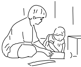
Figure 7: Tracing from the start of Ch laugh in (8), line 18

17 (0.6) 18 Ch: huh huh hih hih hih [hih .hh[hh] 19 M: [uh hih hih [get o:::ff (M tugs at book) 20 (0.4) 21 M: oow ((after 1.1 s M removes Ch's fingers from holes and puts her own fingers in))