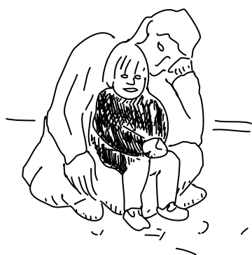
Figure 4: Tracing from the middle of Ch laugh in (4), line 4

1 (M:) * * * 2 (2.5) ((at 2.1 Ch leans forward and breaks wind)) 3 M: oh (.) s[cuse me 4 Ch: °mm° ((Ch sits up, smiling)) 5 (0.5) 6 Ch: fm(h)mm .hhf 7 (1.4) 8 Ch: fdone a poopf 9 M: fu(h)eh did a poopf