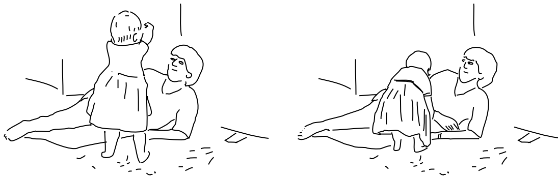
(a) Ch dropping puzzle pieces, line 8