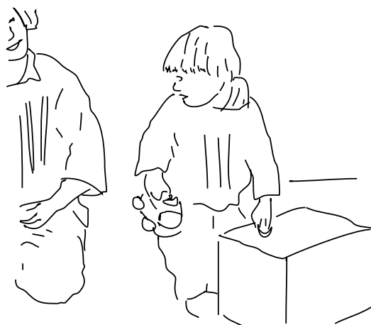
(b) After 1 s of silence, line 9