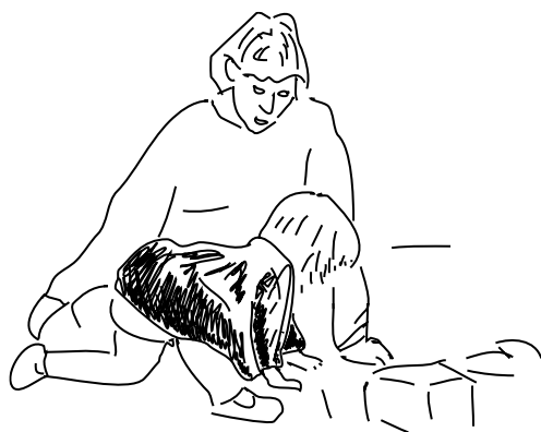
Figure 6: Tracing from the middle of Ch laugh in (7), line 10