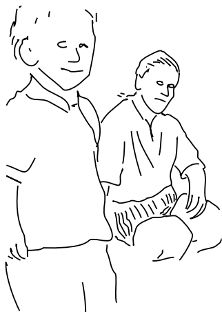
Figure 2: Tracing from the middle of Ch laugh in (2), line 18

7 M: [ba 8 (0.4) 9 M: bang 10 (.) 11 M: it went bang d[idn't it 12 Ch: [.hh 13 (0.6) ((Ch approaches ball)) 14 Ch: fhehf (.) .hhh yab ((Ch picks up ball)) 15 (1.6) ((at 1.0 Ch throws ball)) 16 M: no no no Bridget don't do that lo[ve 17 Ch: [hh 18 Ch: fhe:hʃ 19 M: cuz it's (0.4) quite (.) big and heavy isn't it ((M crawls to ball and picks it up)) 20 (1.8) 21 Ch: ih ih [(bang) 22 M: [this is 23 M: this is what you're supposed to do you're supposed 24 to roll it like this look