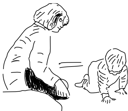
Figure 8: Tracing from the end of (9), line 16

18 (3.2) ((M watches Ch crawling; at 1.6 Ch starts run to settee, panting)) 19 Ch: huh ↑hah 20 (1.3) 21 M: well (.) I don't think it's funny ((M reaches for tea)) 22 (0.4) 23 M: I'm going to drink my cup of tea then ((moves cup to mouth))