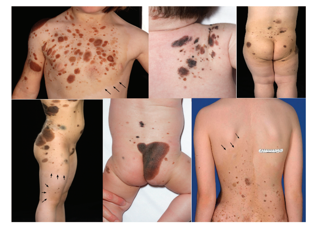
Figure 1. Clinical images of nevus spilus-type CMN in six different patients. The café-au-lait macule background is often invisible at birth. Two separate lesions are indicated in one patient. CMN, congenital melanocytic nevi. Written consent was obtained for publication of all photographs.

on the basis of clustering of many CMN in one anatomical area. Smaller separate lesions in the same individual are often indistinguishable clinically from caféau-lait macules, and are so faint that they can be easily missed (Figure 1). Our primary aim in this study was to look for the genetic basis of this defined phenotypic subset of CMN, in the context of the recent discovery that NRAS Q61K and Q61R mutations are the cause of most causes of multiple CMN (Kinsler et al. , 2013b). In particular, we were interested in determining the mutation in