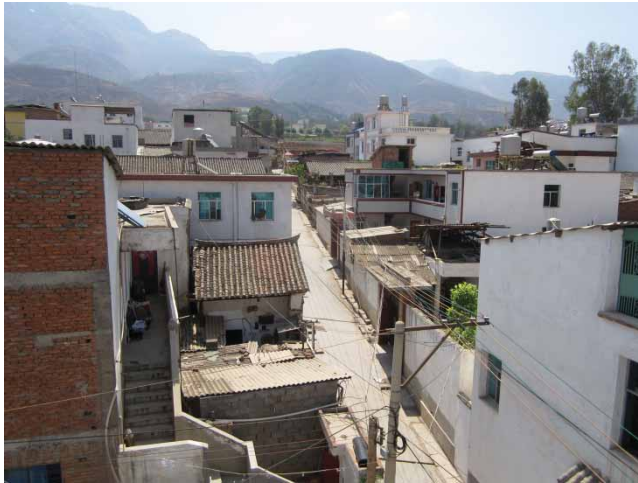
Figure 1. The urban village where the Li family lived.

speculate on the theoretical implications of these observed behaviours. The field notes were also coded with keywords relating to their content, aiding analysis by helping reveal sometimes unexpected links between different domains (i.e. the home and the internet cafe). I choose not to adopt any standard coding scheme, leaving the coding scheme to gradually develop as the database of field notes grew (Bernard, 2006, p. 404). Floor plans and photographic records of the Lis' home (Figure 2) were also made, which ultimately helped to draw attention to the significance of the computer's location within the home (to be discussed later). Towards the end of the fieldwork I began to have more pointed discussions with individual family members regarding their use of the internet.