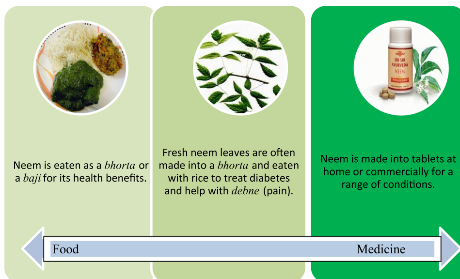
Fig. 1. The transitional nature of neem ( Azadirachta indica ) as food and medicine.

plant can be taken as a food with therapeutic benefits, and also as a medicine. The two diagrams below (Figs. 1 and 2) illustrate two specific examples of a plant's transition from food to medicine (and vice versa). The first example is neem ( Azadirachta indica ). Neem is used for multiple medicinal purposes and comes in many forms; it is bathed in for skin conditions, used as a cosmetic and packaged as pills. As a food it is made into bhortas (crushed with mustard oil) and bajis (fried with onions) and eaten with rice. When eaten specifically for pain or diabetes but in the form of a bhorta , the boundaries between food and medicine begin to blur. The second example, methi ( Trigonella foenum-graecum ), when eaten as food is used as a spice (the seeds particularly) or as an extra ingredient (the leaves as a shak [leafy vegetable]). The general health benefits of methi in food are often acknowledged. As a strict medicine it is normally ingested by itself regularly (for example to mitigate diabetes) or as needed (for example for a stomach ache). However, methi can also be cooked in kitchuri (rice cooked with lentils) and fed to people who are unwell. Additionally, as a medicinal food methi is sometimes added to jau (rice boiled to create a semi-liquid consistency), as explained by an older participant (BM3) "methi