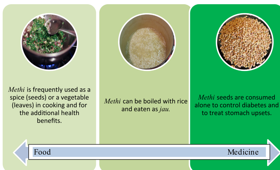
Fig. 2. The transitional nature of methi ( Trigonella foenum-graecum ) as food and medicine.