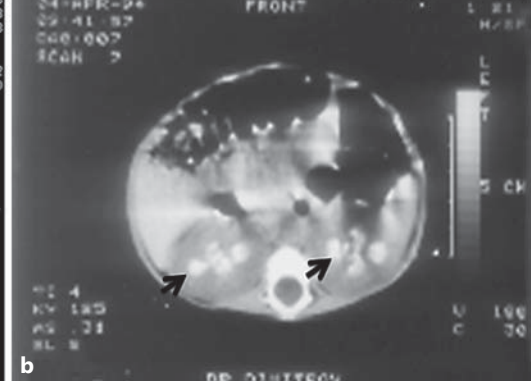
Fig. 2. Representative CT images detailing nephrocalcinosis. Shown are abdominal CT images from patient 4, age 24 years ( a ) and patient 5, age 9 months ( b ). Note the calcium densities in the kidneys (arrows).