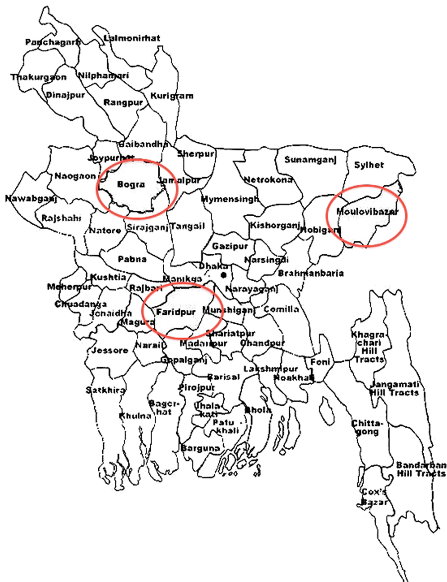
Figure 1 Study location.

A paid female facilitator, who was a local woman of reproductive age with secondary education, led the groups. Each of nine facilitators was responsible for 18 groups. The facilitators received approximately 1 week's training that covered participatory modes of communication, an overview of the country's under-5 health problems, the women groups' community facilitation manual and the use of a pictorial flip chart to