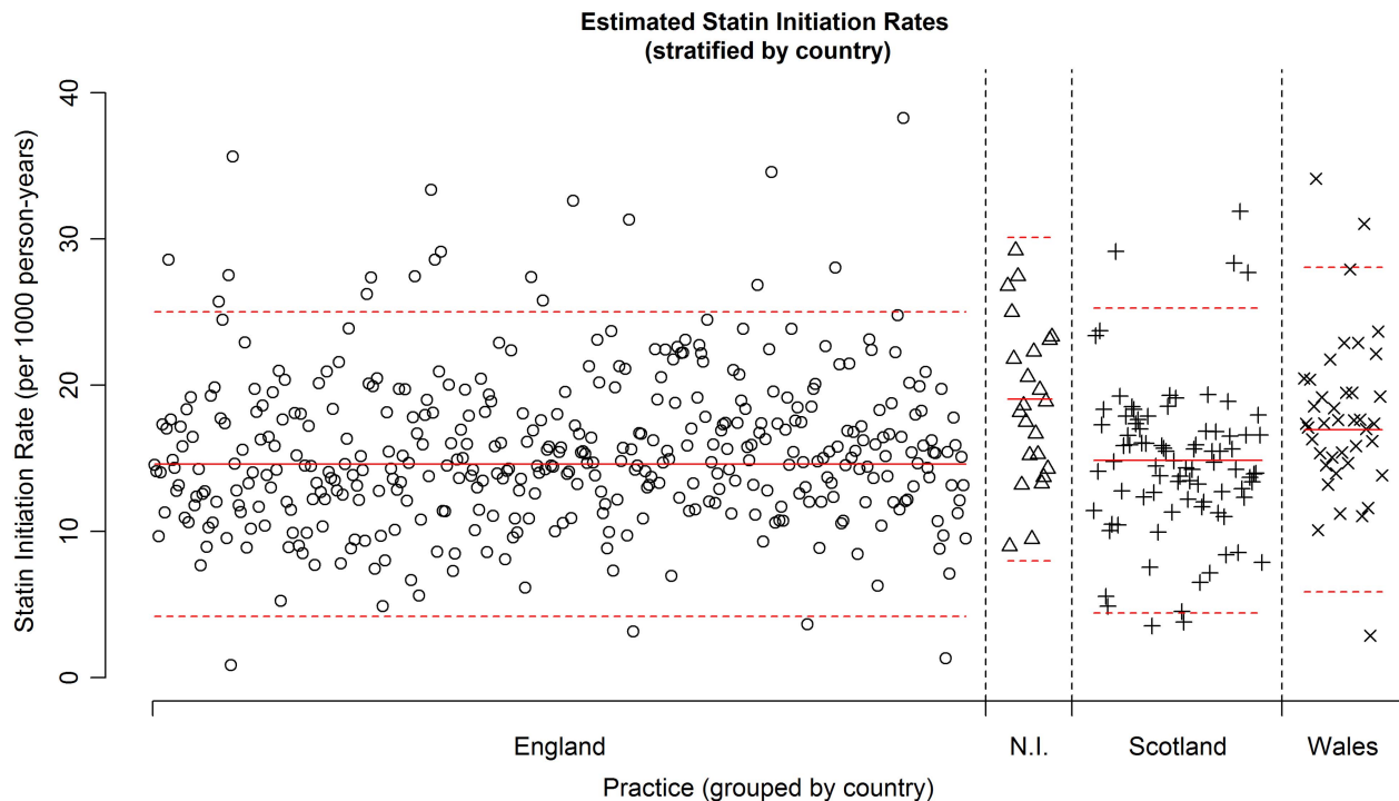
Figure 2 Plot showing the estimated statin therapy initiation rate for each of the 554 general practitioner practices, stratified by UK country. The solid red line indicates the sample mean statin therapy initiation rate within a country. The dashed red lines indicate this sample mean \pm 2SD (sample SD) within a country.

negatively associated with deprivation. 13 29 30 Examining data from 2010, Scotland has a higher rate of myocardial infarction than England, and similarly the North East and North West regions of England have higher rates of myocardial infarction with the South East and East of England reporting the lowest rates. 28 Although our study focused on statin prescription for primary prevention, our findings concur with some of these observations.