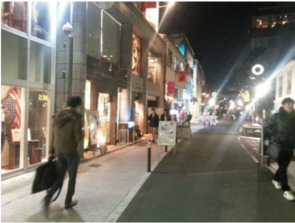
Figure 1 Cat Street, Tokyo, Japan