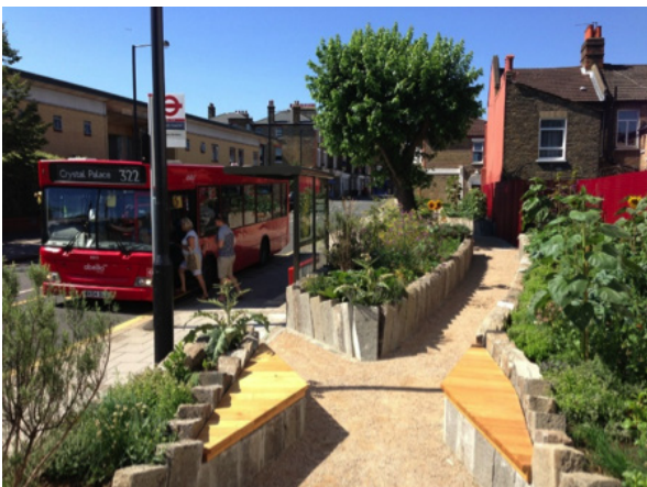
Figure 5 The Edible Bus Stop in Lewisham, London