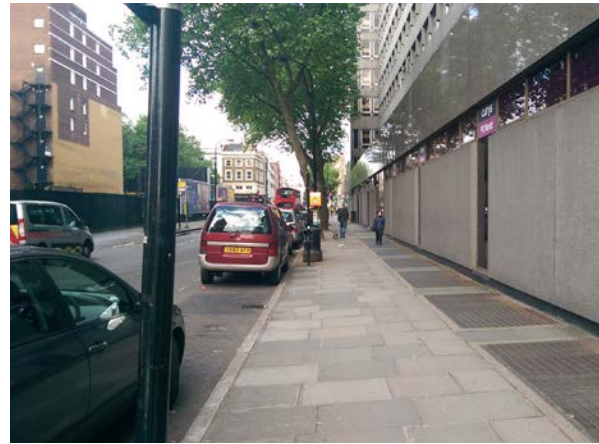
Figure 2 Grafton Way, London, UK