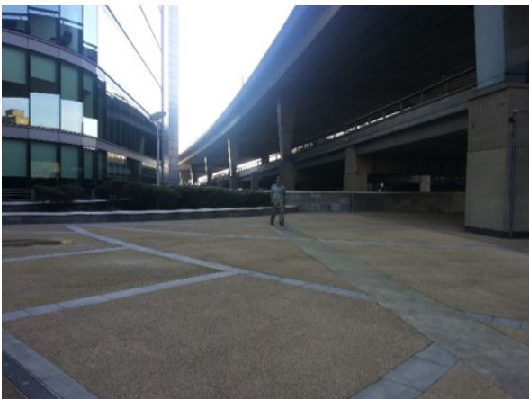
Figure 3 Paddington Basin, London