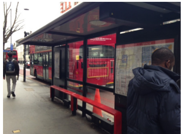
Figure 6 Site of a future 'edible bus stop', Gower Street, London