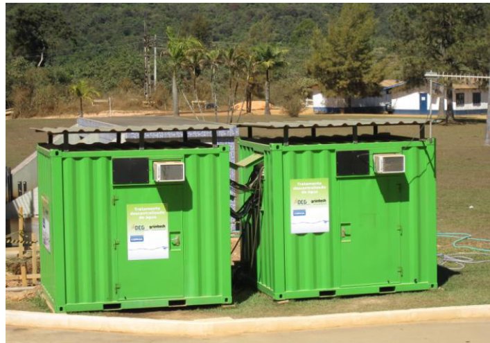
Figure 1: Decentralized water treatment pilot plant in Minas Gerais, Brazil

Following the three stage approach of description, systematization and experimentation 2 studies were carried out in several NICs and DCs. The research region for the exemplary assessment of a modular, SCADA equipped membrane-based decentralized water treatment plant, short pilot plant, was the Brazilian state of Minas Gerais (look figure 1). Qualitative and quantitative methods were applied for the analysis of the empirical data material.