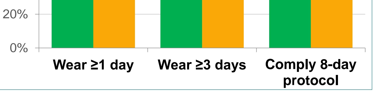
Fig. 4 – Compliance of parents by ethnicity.

were no significant differences in compliance between White British and South Asian parents (Fig. 4).