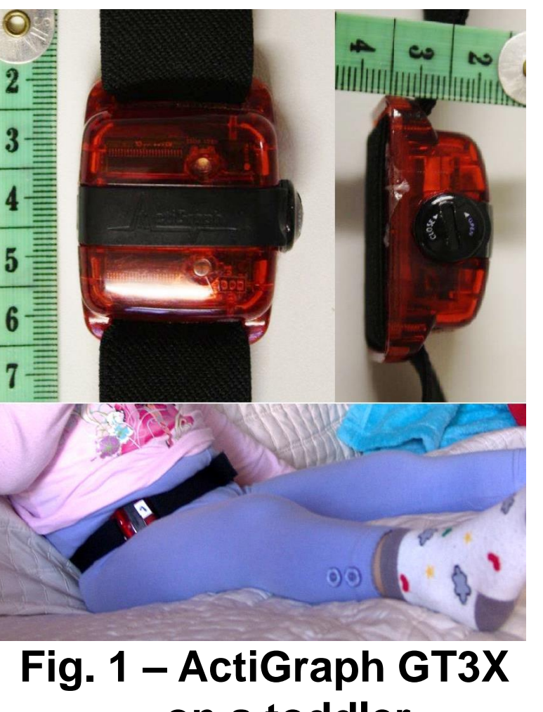
on a toddler.

• Non-wear time was defined as \geq 60min and \geq 10min consecutive zeros for parents and children respectively. A valid day was defined as \geq 10h wear time for the parents and \geq 470min wear time (using 70/80 rule)<sup>5</sup> for the children, and \geq 3 valid days was considered sufficient to assess habitual PA/SB.