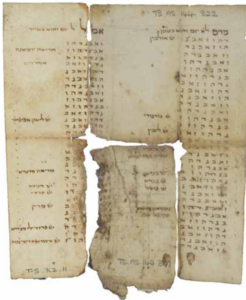
Composite image of T-S AS 144.307, T-S AS 144.322, and T-S K2.11

St Eutrope of Saintes (Charente-Maritime, 30 April).