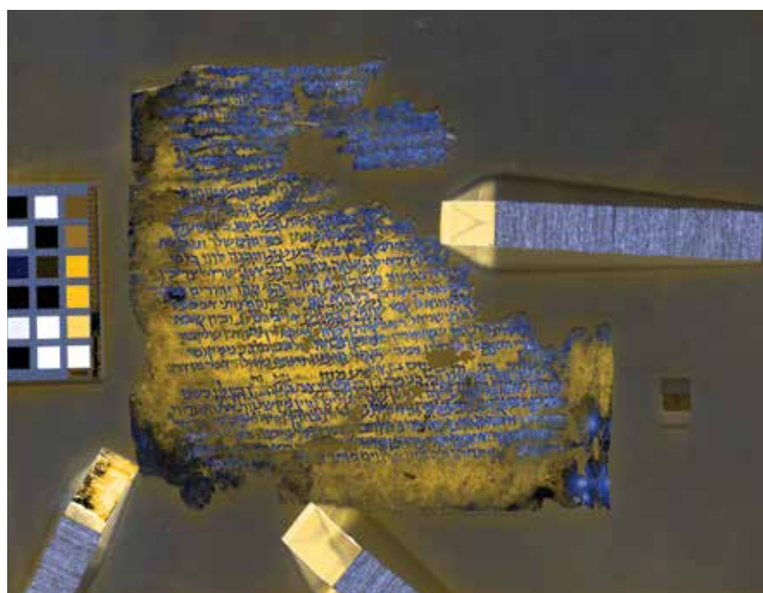
T-S K23.4, undergoing multi-spectral imaging.

The Hebrew palimpsests in particular are a challenge for the reader. They were written on reused leaves from older volumes in Greek, Latin, Christian