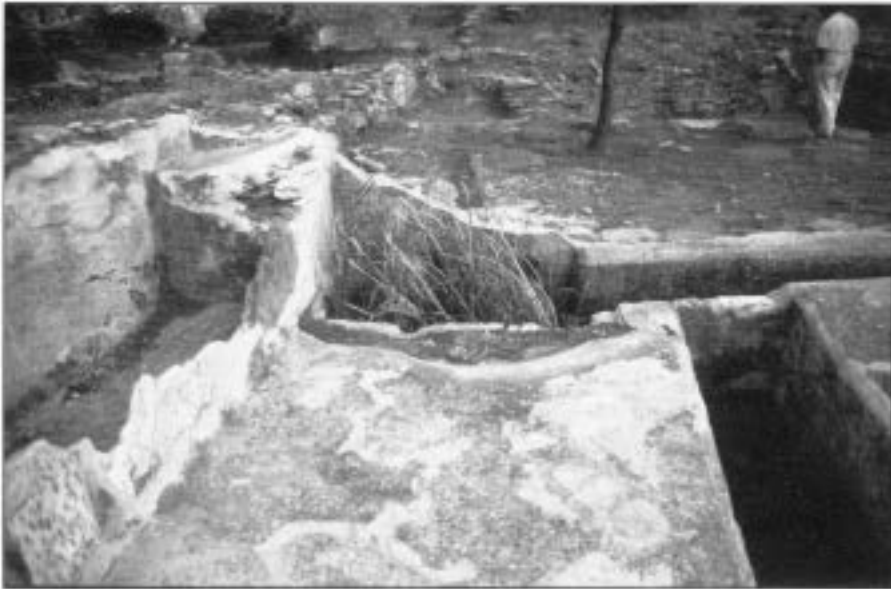
Figure 3 A corner of an ore washery excavated by C. Conophagos, showing (left) the remains of the tank that supplied water for the washing operation that was carried out on the working floor (front centre). The settling basin (centre) still holds enough water to allow swamp grass to grow in it permanently. The channel (front right, approximately 20cm wide) separates the working floor from the drying floor (to the right, out of view).

is smelted to produce a silver-rich lead and a slag (which is discarded). In the second process, called cupellation, the lead metal is burned at high temperature with a strong blast of air in the furnace, leaving behind, untouched, the precious silver metal. Cupellation produces 99 per cent pure silver and vast amounts of lead oxide or litharge.