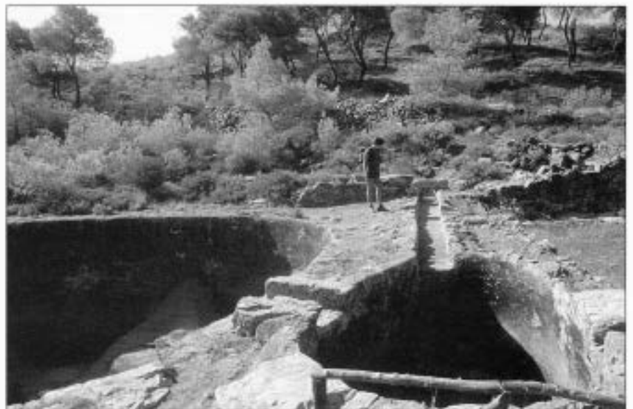
Figure 5 Part of a system of cisterns used to collect water from the surrounding area for use in the washeries. Water flowing from the hill behind was channelled into a first cistern (front centre), from where it overflowed into the main cistern (left). The main cisterns were typically about 10 m deep and even larger in diameter, and they appear to have been roofed (often with a central column supporting the roof) to reduce evaporation in the hot climate and contamination from windblown dirt.