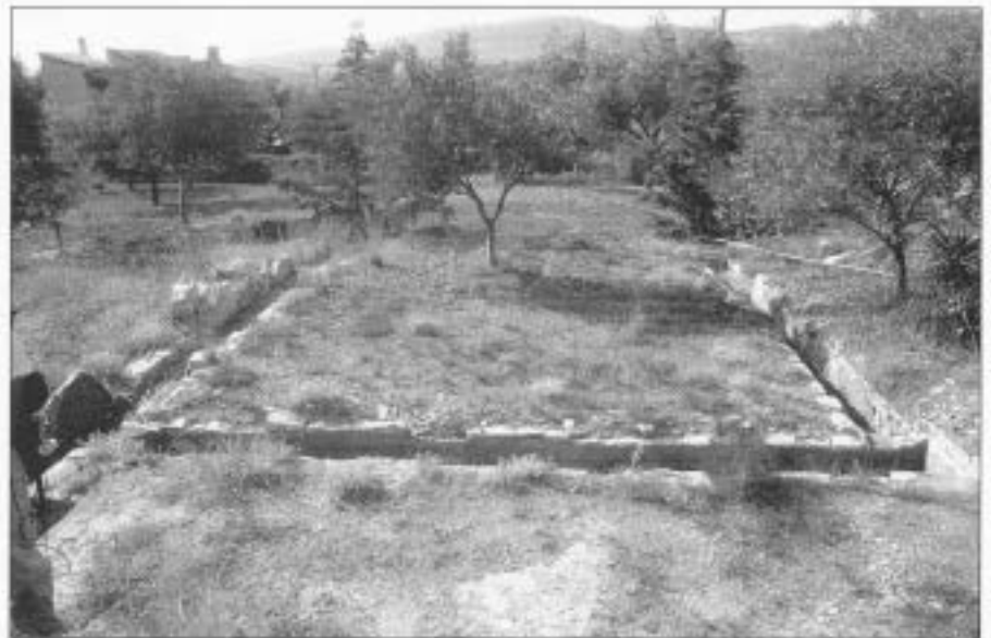
Figure 2 An excavated ore washery (approximately 4 m wide), viewed from where the water tank would have been, overlooking the working floor (front) and the drying floor (centre). The surrounding channel that collected the water from the drying floor for re-use is clearly visible.