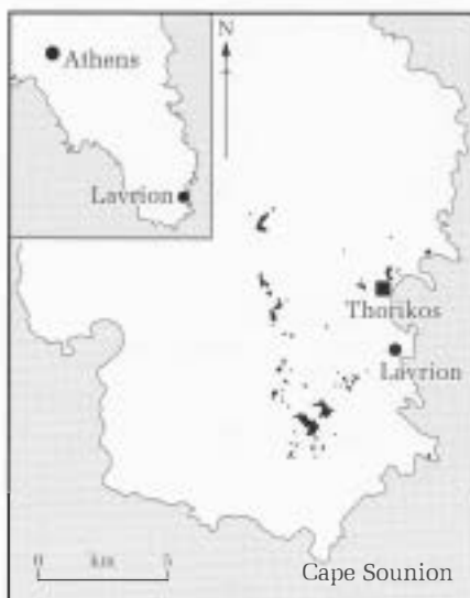
Figure 1 Southern Attica, showing the location of the remains of ancient mines and other metallurgical installations.

To gain the silver from the lead ore, a two-step process is necessary. First the ore