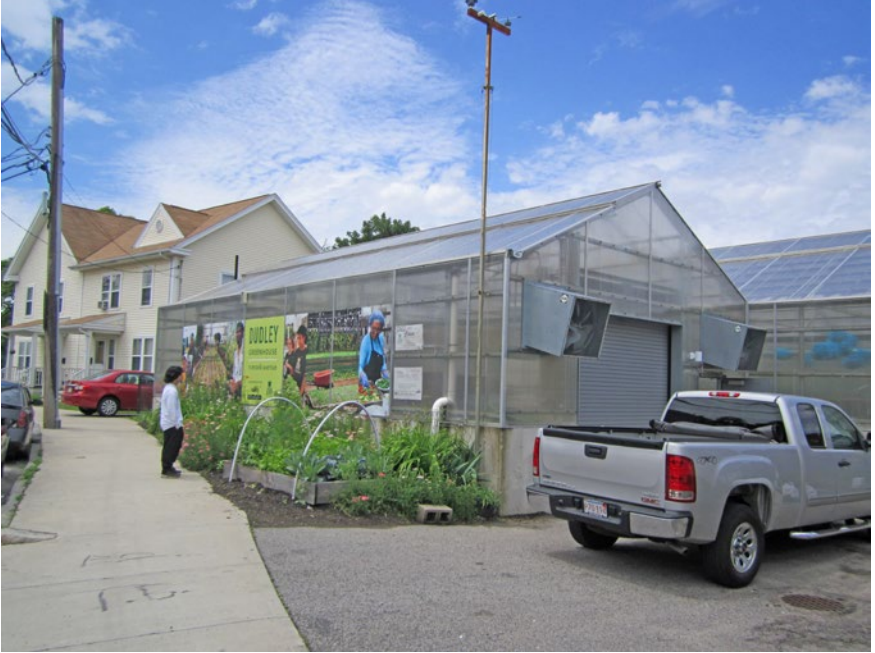
Figure 3. Growing your own activists, Dudley Street

This is confirmed by a meeting with a local councillor in Dunkin Donuts in nearby Blue Hill Avenue, part of the symbolic boundary of the Dudley Triangle, where the message is one of value creation by DSNI and how their intervention has led to neighborhood stabilization and, not least according to the politician, has provided a foundation that has overcome disenfranchisement and exclusion. 35