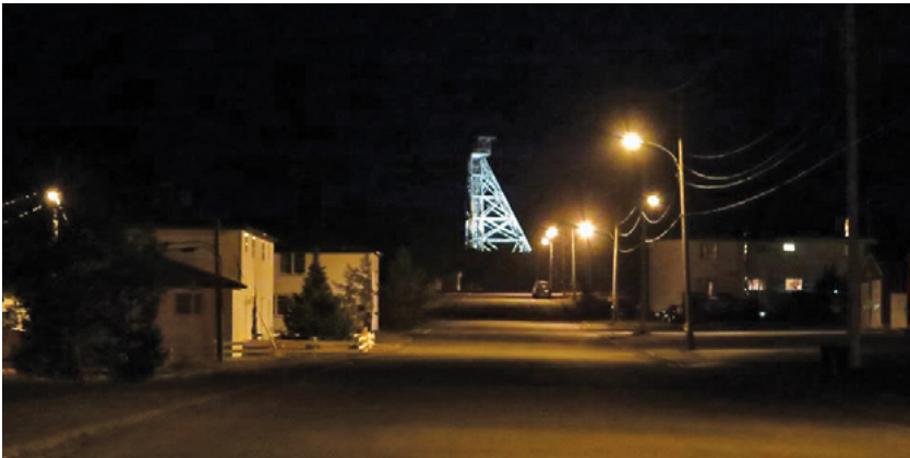
Figure 2. Lucky Strike headframe (deckhead) illuminated atop Main Street.