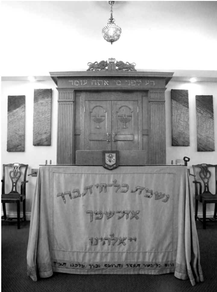
Plate 3 The Maidenhead Synagogue ark.

The Halifax had left RAF Burn in Yorkshire in July 1944 as one of twenty-one bombers from 578 Squadron heading south to strike at targets in Normandy in support of troops engaged in the post-D-Day landings. It was about to fly over Reading when fire broke out in a starboard inner engine. Rather than bale out and leave the plane and its explosive cargo to crash into the densely populated housing below, the pilot – a thirty-three-year old Jewish Australian, Victor Starkoff – diverted away from the town and into the countryside. He circled over Pinkneys Green looking for open land in which to bring the plane down, but in the process lost vital minutes