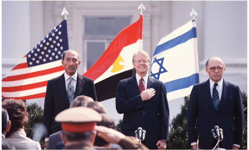
President Jimmy Carter, Egyptian President Anwar Sadat (left) and Israeli Prime Minister Menachem Begin (right) stand during the playing of national anthems on the north lawn of the White House during ceremonies for the Camp David Peace Accords in March 1979.

Despite this alliance, divergent interests emerged in the 1980s, beginning with Reagan's decision to sell AWACS and F-15 aircraft to Saudi Arabia. The limits of the Israeli-American relationship emerged most visibly during Israel's 1982 war in Lebanon (the "First Lebanon War"). The invasion was initially an attempt by Israel to contain Palestinian attacks on its northern border towns, but it quickly escalated into a full-scale effort to remake Lebanon as Israel's Christian ally. Secretary Haig was informed of Israel's war plans by Israeli Defense Minister Ariel Sharon in the spring of 1982. Israel's unprecedented siege of Beirut that summer disturbed Reagan deeply and led to a confrontation with Prime Minister Begin. After Reagan and his advisers realized that Israel's actions posed serious challenges to their broader Middle East strategy, the president remarked to Begin that "Your actions in Lebanon have seriously undermined our relationship with those Arab