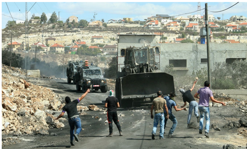
Palestinian protesters throw stones at Israeli vehicles during an October 2013 protest against the expanding of Jewish settlements in Kufr Qadoom village, near the West Bank city of Nablus.

In September 2010, Obama hosted Netanyahu, Abbas, Jordan’s King Abdullah and Special Envoy Mitchell for the restart of negotiations to reach a final status settlement. As Israel’s settlement moratorium lapsed, the talks broke down, and Mitchell eventually resigned from the office of the Special Envoy in May 2011.