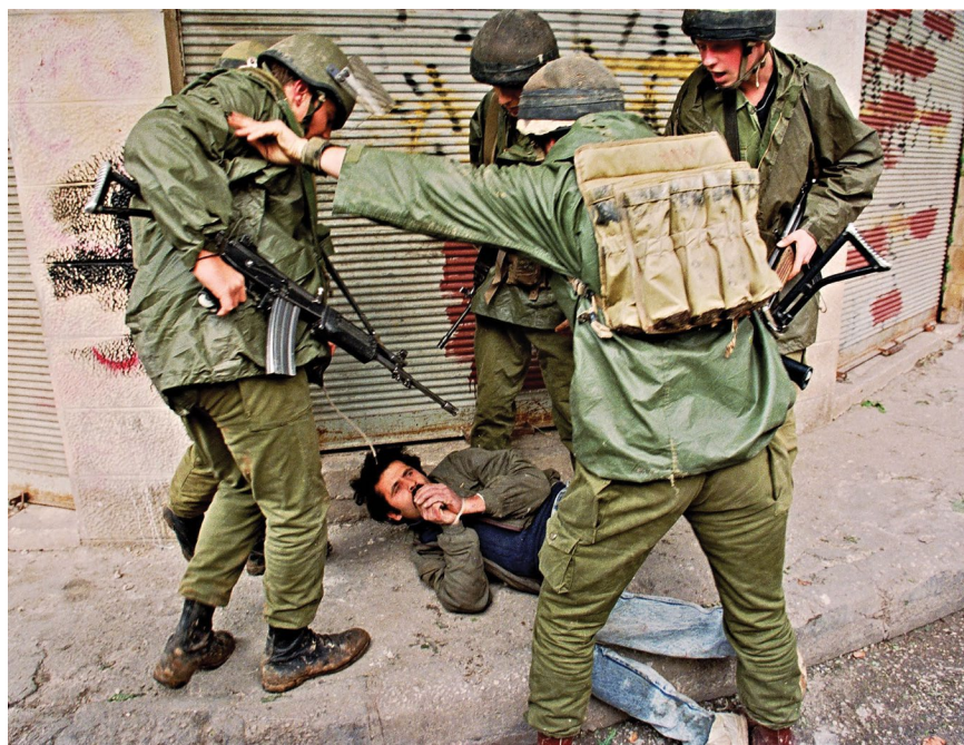
An Israeli soldier restrains another from manhandling an arrested Palestinian who lies on a Nablus street with his hands tied together, during anti-Israeli demonstrations in the first intifada in February 1988.

manner that has affected both countries well into the 21st century.