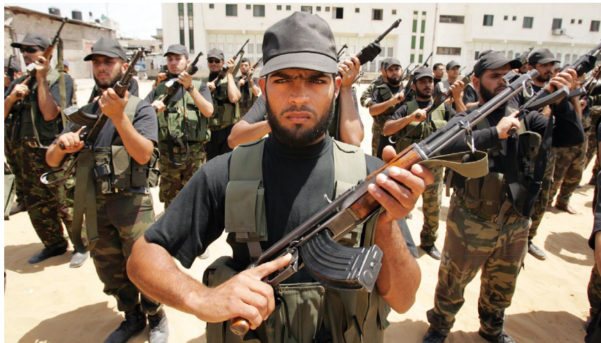
Hamas militia members take position after they evacuated Gaza streets in May 2006. The Hamas-led Palestinian government ordered its militia off Gaza's streets in the wake of clashes with President Mahmoud Abbas's rival Fatah movement that stirred fears of civil war.

ment between Israel and the Palestinians. Once again, the U.S. had come to the realization that peace between Israel and its neighbors was a necessity for securing U.S. interests in the region, and that by ignoring the urgency of the issue, the conflict had only been exacerbated.