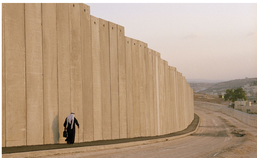
A Palestinian man walks along the Israeli-constructed barrier wall separating Jerusalem from Abu Dis, a village in the West Bank.

Secretary of State Condoleezza Rice led the Bush administration’s revival of U.S. efforts to mediate peace, and invited Israelis, Palestinians and other Arab representatives to a conference in Annapolis, MD, in November 2007. The Annapolis Conference was intended to restart the peace process and boost international support for a negotiated settle-