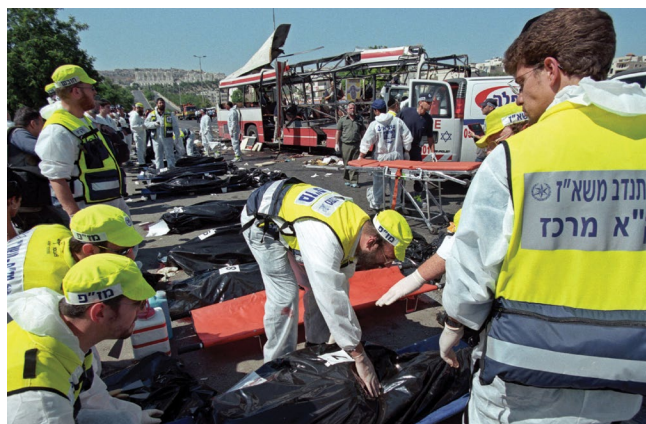
Rescue crews remove body bags from the site of a Palestinian suicide bomb attack on a Jerusalem bus in June 2002.