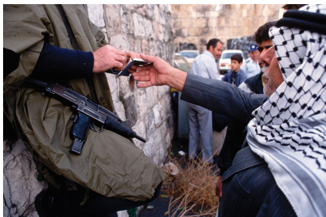
A Palestinian hands his I.D. to an Israeli soldier at a Jerusalem checkpoint in 1991.

in January 2001, by which point the Al-Aqsa Intifada , or the second Intifada , had erupted.