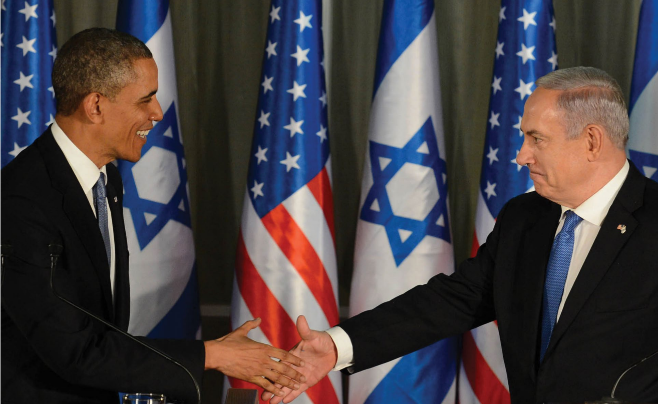
U.S. President Barack Obama shakes hands with Israel's Prime Minister Benjamin Netanyahu during their press conference in Jerusalem, part of Obama's official state visit to Israel and the Palestinian Territories in March 2013.

The depth of emotion that surrounds public and private conversations about the relationship between Israel and the U.S. can be staggering. From college campuses to church groups, think tanks to synagogues, and op-ed pages to congressional hearings, few issues are as contentious as America's relationship with the State of Israel.