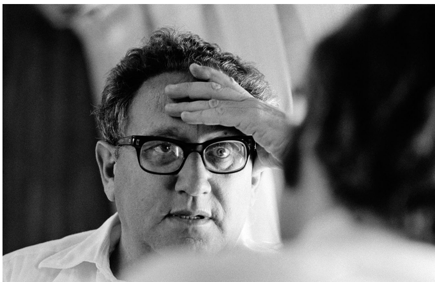
U.S. Secretary of State Henry Kissinger in the cabin of his aircraft in September 1975, as he flew from Alexandria, Egypt, to Tel Aviv, Israel, during negotiations to return the Sinai, which was captured by Israel during the 1967 War, back to Egypt.

The election of Israeli Prime Minister Menachem Begin in 1977 represented a decisive challenge to U.S.-Israeli relations. Begin was a revisionist Zionist with deep-seated ideological opposition to Palestinian territorial rights. He was also a believer in settlement expansion in the occupied territories, which he pursued with the help of Ariel Sharon, his agriculture minister and later Israel's 11th prime minister. Roughly 5,000 Jewish settlers lived in the West Bank when Begin entered office; however, the number of settlers continued to rise, to over 80,000 by the late 1980s, even after the signing of the historic Camp David Accords. These accords, reached on September 17, 1978, led to a formal Egypt-Israel peace treaty signed by Sadat and Begin on March 26, 1979. The treaty ensured the return of the Sinai Peninsula to Egypt, but Begin's price was the retention of the West Bank, which he referred to by the biblical name of "Judea and Samaria." The peace treaty also included more military and economic aid to Israel than had been given under any previous administra-