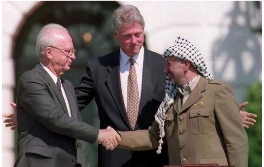
U.S. President Bill Clinton watches as PLO leader Yasser Arafat shakes hands with Israeli Prime Minister Yitzhak Rabin, September 13, 1993. Rabin and Arafat shook hands for the first time after Israel and the PLO signed a historic agreement on Palestinian self-government in the occupied territories.

But the peace process launched by the Oslo Accords was nowhere near as picture perfect as the famous handshake suggested. In September 1995, Arafat and Rabin signed the Interim Agreement on the West Bank and Gaza Strip, or Oslo II, establishing the Palestinian Authority (PA) and dividing the West Bank into three separate zones of control. There was enormous skepticism of Arafat's move in the Arab world, where he was seen as selling out meaningful Palestinian sovereignty for the sake of his own return to the West Bank, where he was to be appointed as president of the PA. Oslo II granted the PA limited self-government, for an interim period of time, providing the vestiges of statehood without actual content. The process around Oslo lulled its proponents into the false belief that real issues like Jerusalem, refugees' right of return, settlements and security were being dealt with. Oslo II became the basis of the Wye River Memorandum in 1998 and President George W. Bush's Roadmap for Peace in 2002.