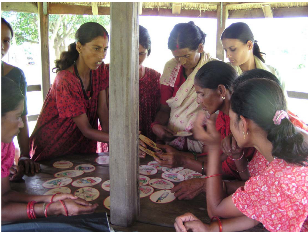
Figure 3 Women's group using picture cards