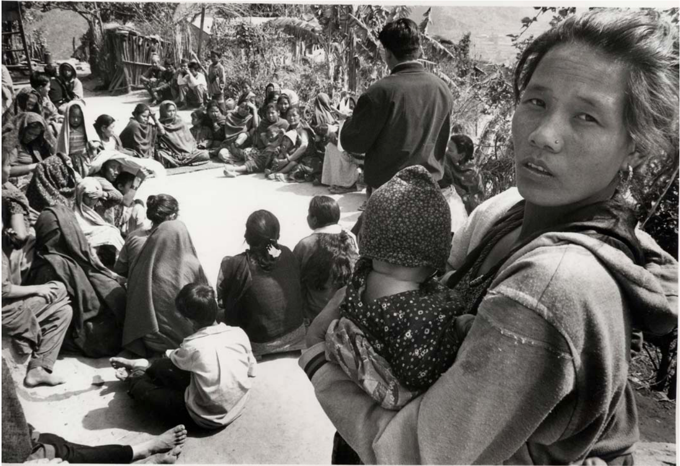
Figure 2 Women's group and facilitation manager