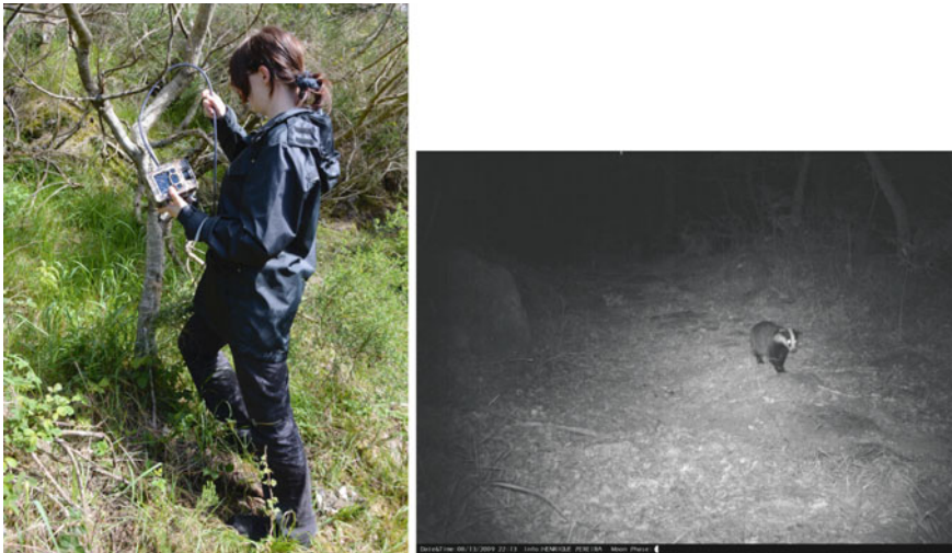
Fig. 4.2 Camera trapping is becoming one of the main methods to monitor medium to large mammals

With the development of new technology, remotely monitoring mammals becomes more practical, often cutting down on man-hours spent in the field. In particular, camera trapping has been increasingly applied worldwide in monitoring and conservation (Fig. 4.2). It has been applied in a range of contexts from tracking specific species (e.g., the pygmy hippo in Sapo National Park; Collen et al. 2011), to multi-species monitoring, including tracking rare or elusive species in dense habitats such as tropical forests (Munari et al. 2011), monitoring small invasive