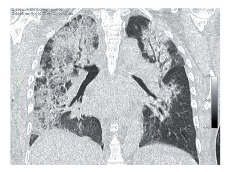
Fig. 1. CT thorax performed after 13 days of mechanical ventilation, showing diffuse bilateral alveolar infiltrates with areas of ground-glass opacity, and dilatation and distortion of bronchial structures.