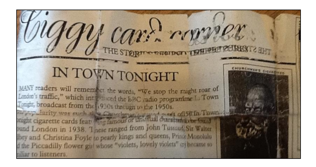
Figure 1: Photocopy of a part of the newspaper article chosen by George