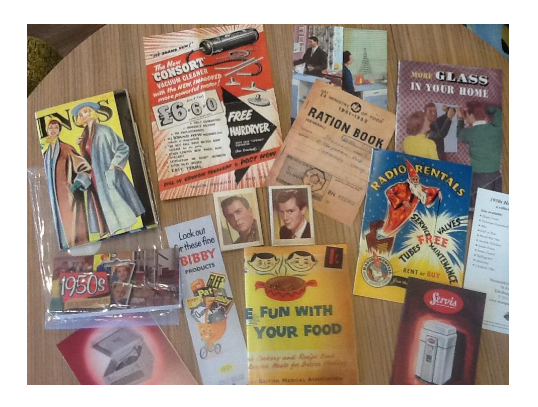
Figure 3: Facsimiles of adverts and leaflets from the fifties used for eliciting stories