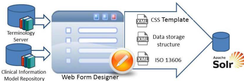
Figure 2. HEMIC tool architecture

The output of the modelling process will be initially in the form of CSS templates, and XML data storage structure. These outputs might be directly incorporated by the implemented AHS EHR systems as a new web form consistent with the established information governance. In addition, it will be provided an additional output according to the ISO13606 Extract structure. In the future, it is foreseen to be able to satisfy other specifications based on generic reference model such as CIMI models or openEHR. The HEMIC tool has been designed to provide the approved semantic structures to be incorporated in the EHR forms. Figure 2 shows a representation of the HEMIC tool architecture.