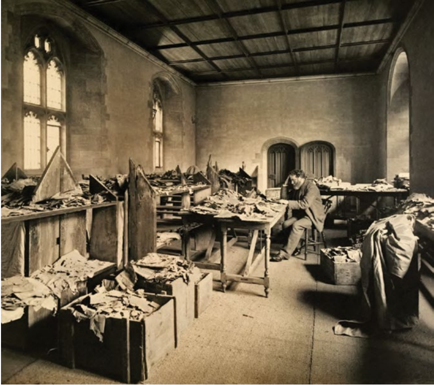
1 Solomon Schechter at work in Cambridge University Library, surrounded by his Cairo Genizah collection, 1898.