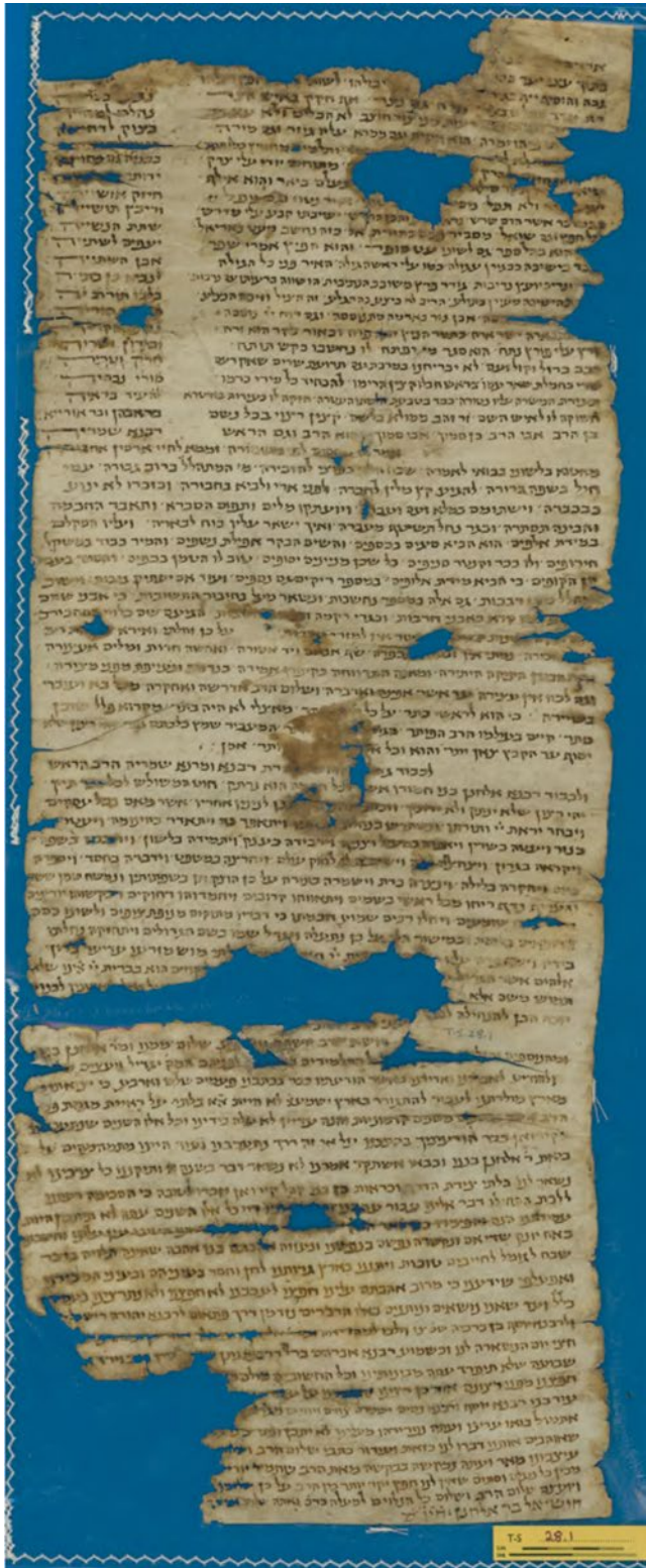
2 A lengthy letter in Hebrew by the Qayrawan/Kairouan sage Chushiel b. Elchanan to Shemarya b. Elchanan in Fustat (Genizah T-S 28.1)