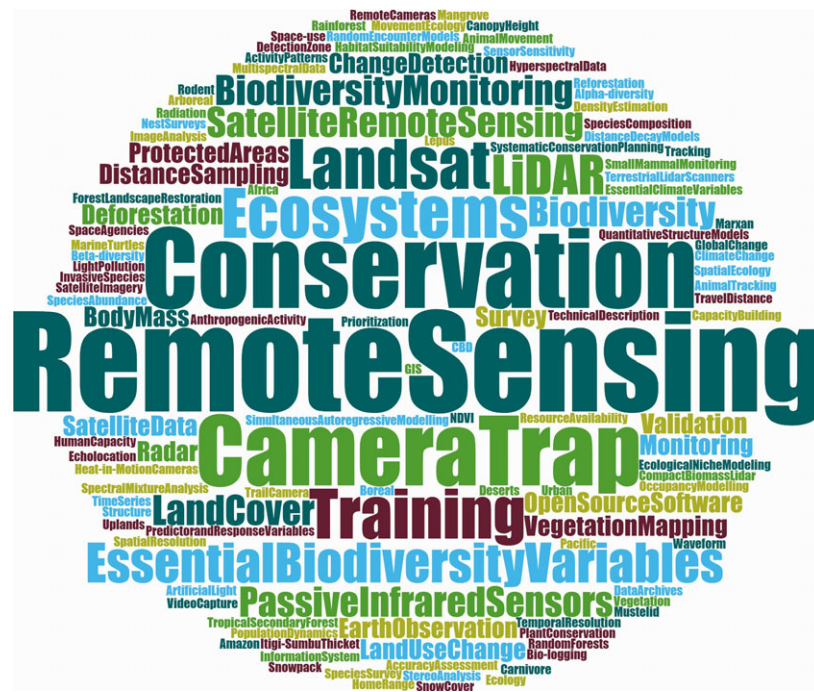
Figure 2. Keyword wordle, based on the keywords used by authors to describe their contributions published in Remote Sensing in Ecology and Conservation .