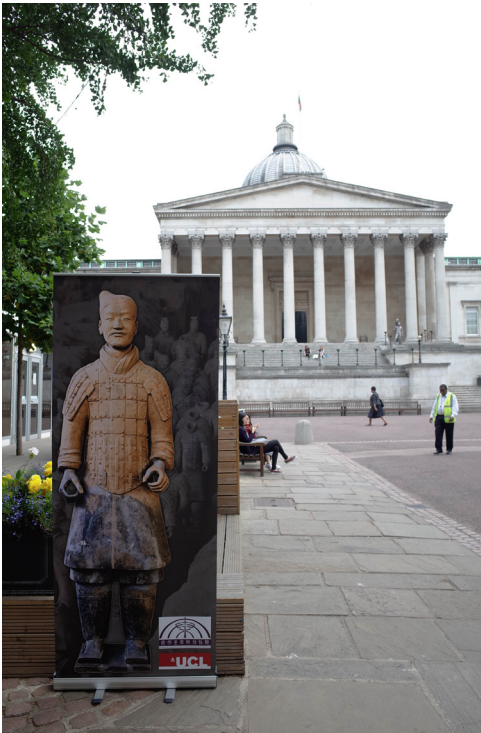
Figure 3: Poster advertising the symposium entitled 'Emperor Qin Shihuang's Mausoleum in Global Perspective' (Photo Lisa Daniel).

In tandem with this signing, forty leading international archaeologists, conservators, historians and sinologists met at UCL for an invitation-only symposium on Emperor Qin Shihuang's Mausoleum in Global Perspective ( Fig. 3 ). The event, jointly organized by the Emperor Qin Shihuang's Mausoleum Site Museum and the IoA (led by Marcos Martínón-Torres and Andrew Bevan ), and sponsored by the BBC and National Geographic , included presentations and discussion on numerous dimensions of the site, famous worldwide for the Terracotta Army and for its status as a World Heritage site. A special session was devoted to the ' Imperial Logistics: The Making of the Terracotta Army ', project, a joint research initiative between the UCL IoA and the Museum of Emperor Qin Shihuang's