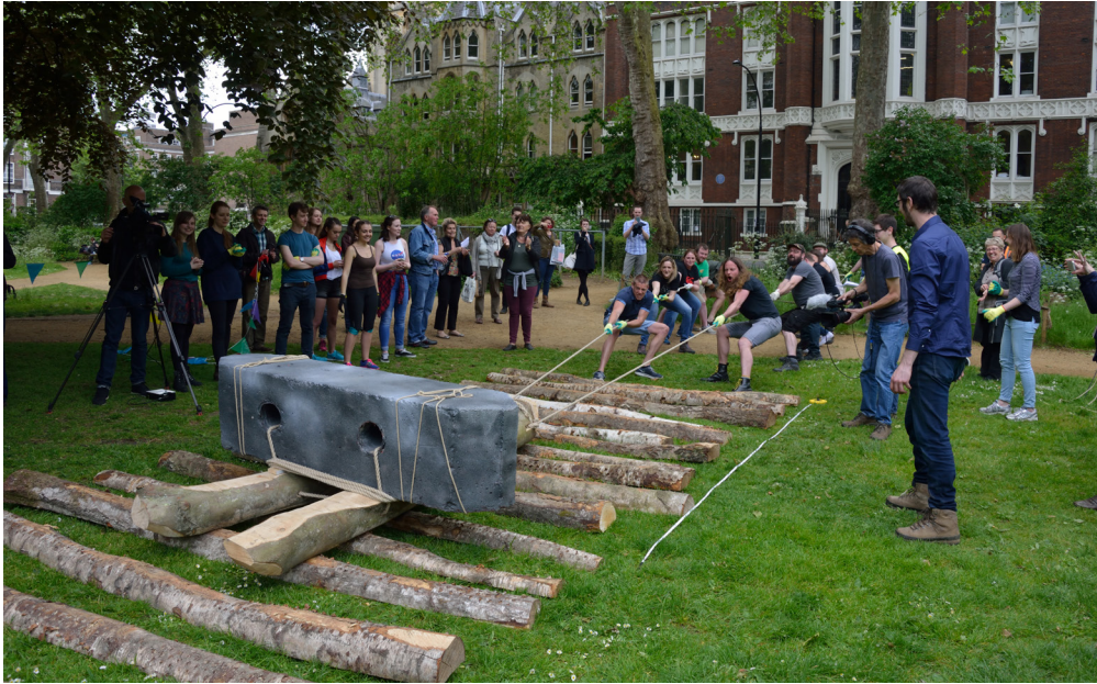
Figure 4: The stone dragging experiment in Gordon Square garden.