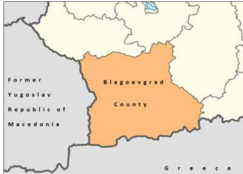
Map 3. Blagoevgrad County (Pirin Macedonia) in Bulgaria and neighbouring states 109

Overall, contacts with Greece and FYROM have been facilitated by globalization and EU integration, 110 and have brought about the emergence of new actors (regional political actors, NGOs and business representatives), which are more likely to support regionalism as an economic and political agenda.