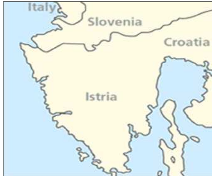
Map 2. Contemporary Istria tucked between Italy, Slovenia and Croatia 71

The provision of a legal base was followed in July 2001 by a process of decentralization, which involved the transfer of certain public functions from the central to the subnational level. 72 It comprised the delegation of self-governing responsibilities to local and regional administrative units, 73 and fiscal decentralization, or the provision of additional income for the financing of material and financial expenses and public services. The responsibilities for the provision of public services on the regional and local level were given to authorities closer to citizens, according to the EU principle of subsidiarity, while the central level was only to be involved in the event that the coordination and distribution of benefits on lower levels was impossible or less effective. 74 The financing of public services continued in their foremost part to be provided by central authorities.