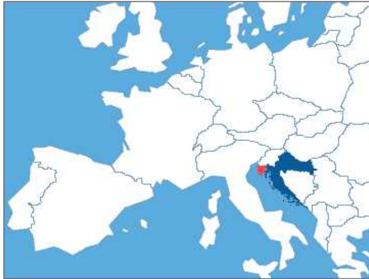
Map 1. Iria in Europe