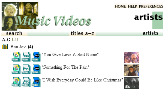
Figure 7: Music Videos browsing results

In the Folk Music collection, the user is presented with no choice of output format for the available output modalities. This lack of choice leaves less scope for user error.