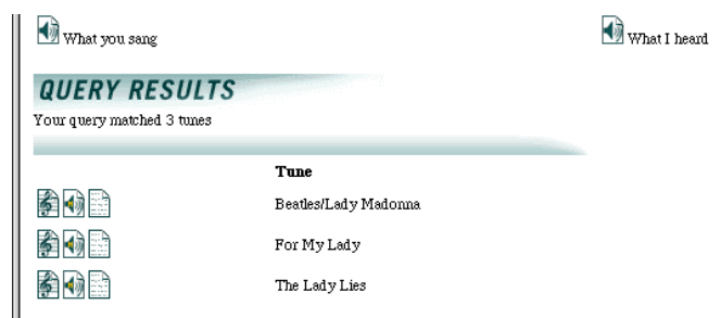
Figure 6: NZDL Music Collection (MidiMini) query results

Within the NZDL Music Collection, the different types of output are represented by icons next to the tune names, as shown in Figure 6. In this example, there are three alternatives: to display the musical score (the icon with the treble clef), to hear a MIDI sound file (the speaker icon) or to see textual information about the tune. There is a notational difference between MIDI files (which can only be played back in MIDI format) and other sound files (see for example the speaker icon next to ‘what you sang’), which users are expected to understand.