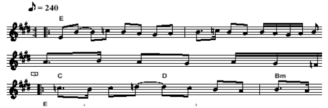
Figure 2: Extract from the score of "Layla"

For the user who already has the musical score and is simply trying to access the ABC notation or a MIDI file, these problems are surmountable, but the user who is 'playing by ear' is likely to experience tune retrieval as a very 'hit or miss' affair.