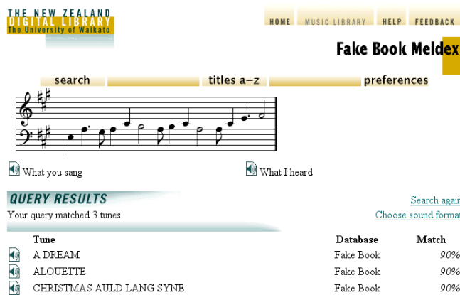
Figure 3: Search results, including feedback to user on ‘what I heard’

In summary, in both contour-matching systems, there are user difficulties caused by differences between a user’s mental representation of a tune, which will typically include approximate pitch intervals and note durations in the melody, and the precise but abstract representation of the melody in the database, which abstracts over pitch intervals (leaving just a contour) and durations (leaving just temporal sequence). Additional user difficulties lie in the means of translating the tune in the head into an external representation that can be entered into the computer system (whether that be an ABC contour or a sung melody) and then checking that the external representation is correct.