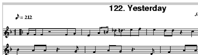
Figure 1: Extract from the score of "Yesterday"

The difficulty with slurred notes is illustrated by "Layla", as shown in Figure 2. This has a contour representation of 'usuddduuudddu'. Here, notes (e.g. second and third of first bar) are slurred, so that the later of the two notes is not sounded separately. Again, the interval between these notes has to be represented as 'same' even though the second is not (audibly) a separate note from the first. In future, the developers are experimenting with removing 'same' from the matching, to assess whether more satisfactory results are returned.