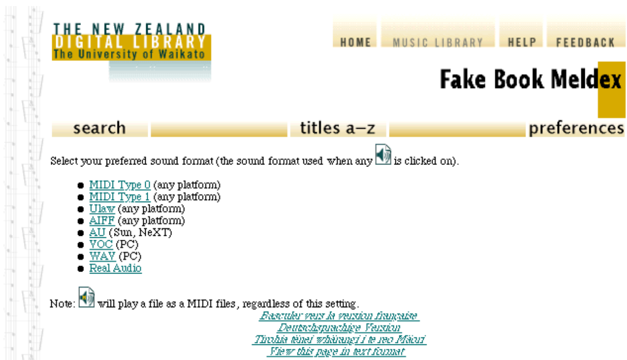
Figure 5: Sound output formats in NZDL Music Collection

Chambers (personal communication) argues that the difference between the various graphical formats is important: that PS is much higher quality than GIF or PNG, and that in folk circles lower quality is generally preferred. In terms of modalities, as well as the primary modality (visual-symbolic-continuous) through which the tune is represented, there is a dependent modality, also visual-symbolic-continuous, that communicates the ‘folkiness’ of the paper representation. Clearly, for some – arguably more sophisticated – users, this property of the visual representation is important, while for others it is not. However, this understanding is only available to people who are experts in both folk music culture and computer music representational formats; for others, additional explanation would be helpful, or the choice may be bemusing.