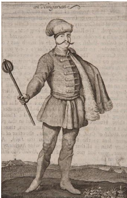
Fig. 1: Two images from a rare travel book in the UCL SSEES Library by Edward Brown, dated 1685 and entitled A brief account of some travels in divers parts of Europe: viz. Hungaria, Servia, Bulgaria, Macedonia, Thessaly, Austria, Styria, Carinthia, Carniola, and Friuli, through a great part of Germany and the Low-Countries ... : with some observations on the gold, silver, copper, quick-silver mines, and the baths and mineral waters in those parts, as also the description of many antiquities, habits, fortifications, and remarkable places.

The Koninklijke Bibliotheek (KB) in the Netherlands is contributing 30,000 pages of texts and drawings from manuscripts in French, Dutch and Latin.