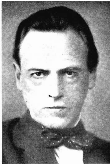
Photograph of Cyril Scott (from the "new and extended" edition of Music: Its Secret Influence of 1950)

This state of psychological freedom could have possibly motivated social change, for "The subconscious prisoner" is also released from the "gaolership of social customs" (p. 73). By establishing an emotional rapport with the sick, the poor, and the destitute, Beethoven's music increased awareness of their appalling conditions, thus galvanizing efforts to improve them. Scott alluded to the steep rise in humanitarian activity during the