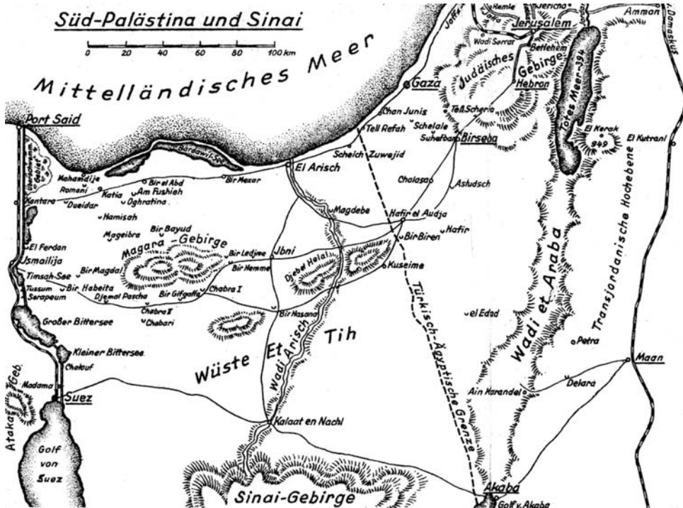
Fig. 2: Routes through Sinai