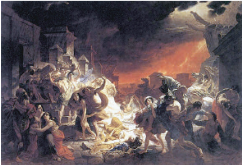
Figure 3 Karl Briullov, 'The Last Days of Pompeii' (1833)

suggesting that this is the work of the gods. Beneath swirling clouds, the land masses divide, inundated by the sea, which is rapidly covering the mountains below, displayed like a map in relief. We can see small signs of human habitation and civilisation – on the right, fortress-like buildings, on the left, ships going under water, a temple, toy-sized idols on pillars, people scurrying about like ants – but all this seems very distant, too far away to matter.