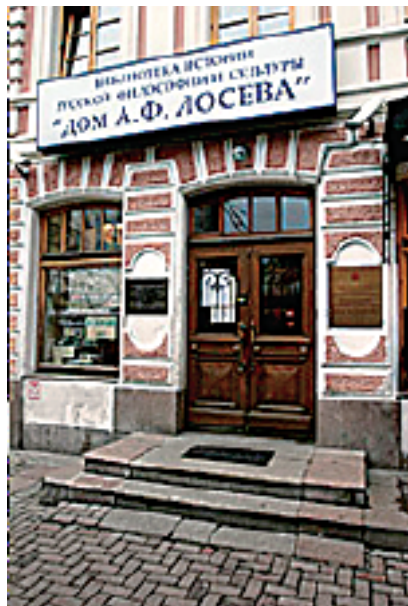
Figure 9 The House of A. F. Losev (2007)

was marked with a conference on the links between classical antiquity and Russian culture of the Silver Age, resulting in a fine book published last year. 72 Interviewed in 2007 for the journal The Elite of Society [ Elita obshchestva ], she emphasised the underlying unity of East and West that could be found in the world of classical antiquity and potentially recovered through serious study (in this connection it is interesting to note that Bakst also saw Greece as part of the East and often introduced Oriental elements into his Greek designs). She lamented the current ‘exceptional decline’ of culture in Russia, noting that schools in the 1930s and 1940s, even in the 1950s, were far better. Although books on classical antiquity are still being produced, some dilettante authors have entered the field. When asked to name the top classicists in Russia, she complained about the fragmented nature of contemporary scholarship – no one could match the level and breadth of Zelinskii. Only Losev succeeded in combining the study of philosophy, philology, aesthetics, and mythology, because he still had ‘ zakvaska prezhniaia ’, the ‘culture of the past’ – in both senses of the term. 73