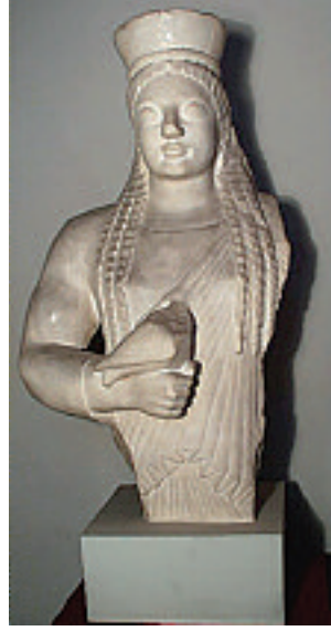
Figure 5 The Lyons Koré (ca 540 B.C.)

in space in another dimension over this horrific picture of cosmic catastrophe? Her three long braided tresses and dress make her look like an archaic Greek woman or goddess. She holds a small blue bird, possibly a dove, to her breast. As a sacrificial offering? If so, to whom or what? And why is she smiling, so unperturbed and detached, with her back to the scene of destruction below her. One thing is clear: she is looking at us, the viewers, and challenging us to make sense of her relation to the awesome scene behind her. Who can she be?