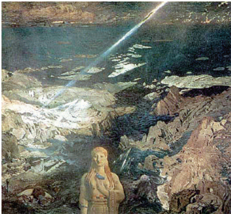
Figure 2 Lev Bakst, 'Terror antiquus' (1908)

a letter to his friend, the composer and music critic Walter Nouvel (1871–1949), proudly reporting on the painting's 'huge and resounding success', reflected in the forty reviews that he had collected from French and English journals. 18 The picture was then shown in St Petersburg at the Salon exhibition, organised by Sergei Makovskii (1877–1962) from 4 January to 8 March 1909, featuring over six hundred works by some forty artists. 19 It made a huge impact, not just because of its enormous size (at 2.5 by 2.7 metres, it filled an entire wall), 20 but also because it confronted viewers with a disturbing riddle – a powerful image of catastrophe alongside an enigmatic smiling female. What exactly was the artist trying to represent?