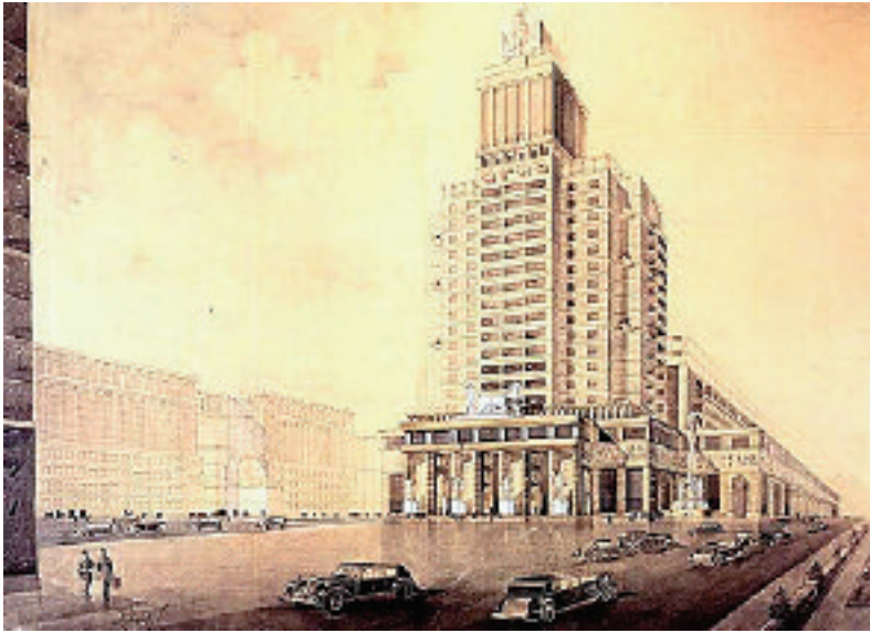
Figure 6 The House of Books project (1934)

As the state consolidated its power, it became more confident of its ability to integrate the past into its cultural agenda and set about creating its own ‘Soviet-style’ Acropolis. By the 1930s attitudes to the classical heritage began to change. New translations of the classics were commissioned and published in luxury editions. The regime’s wish to be identified with images of imperial greatness led to a renaissance of neo-classical architecture. The project of 1934 for a new House of Books is typical of the rather monstrous designs of the period that tried to ape the grandeur of classical tradition. Mikhail Bulgakov (1891–1940) drew some rather uncomfortable parallels between Soviet Moscow and Roman imperial power during his work on The Master and Margarita in the 1930s.