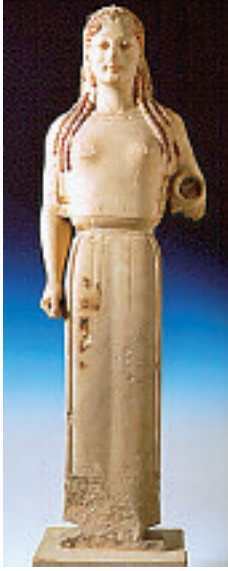
Figure 4 The Peplos Koré (ca 530 B.C.)