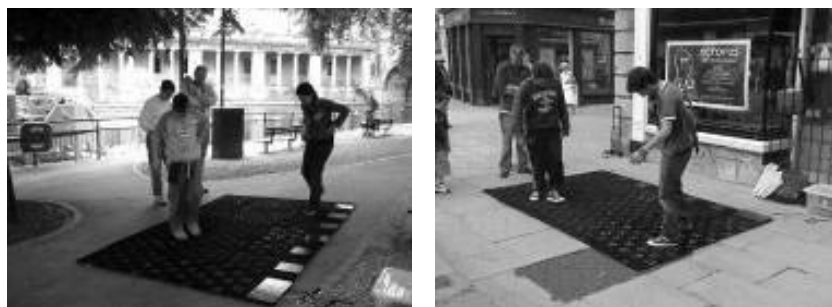
Figure 1. Photographs taken during the evaluation sessions.

The installation was tested in three different locations in the city of Bath, the sessions were carried out during daytime with an additional test during the evening. We selected locations with low, medium and high pedestrian flows. A range of empirical observation methods were implemented. People's movements in and out of the interaction space were observed and recorded, and the type of activity taking place in the surrounding space was captured. The form of peoples' interactions with the prototype, and with the other people in the area, was observed and video taped by two researchers. In addition, peoples' movement on the digital surface was tracked. Following the session, a selected number of participants (20) were debriefed in both a structured discussion and using a questionnaire.