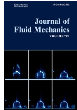
Plate-injection into a separated supersonic boundary layer