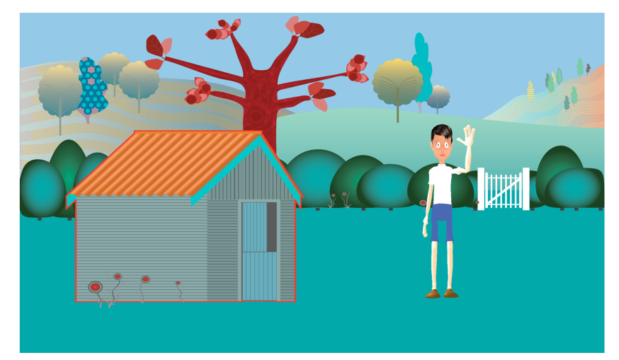
Figure 3: The magical garden

targeted skill and the child's needs. The agent performs a role of a practitioner / peer and are the main means through which the learning activities in ECHOES are facilitated to the child. Figure 3 shows the implemented the ECHOES garden environment together with the ECHOES agent – Paul – who is able to engaging the child in joint attention through different means including gesture, verbal request, eye-gaze and a combination thereof.