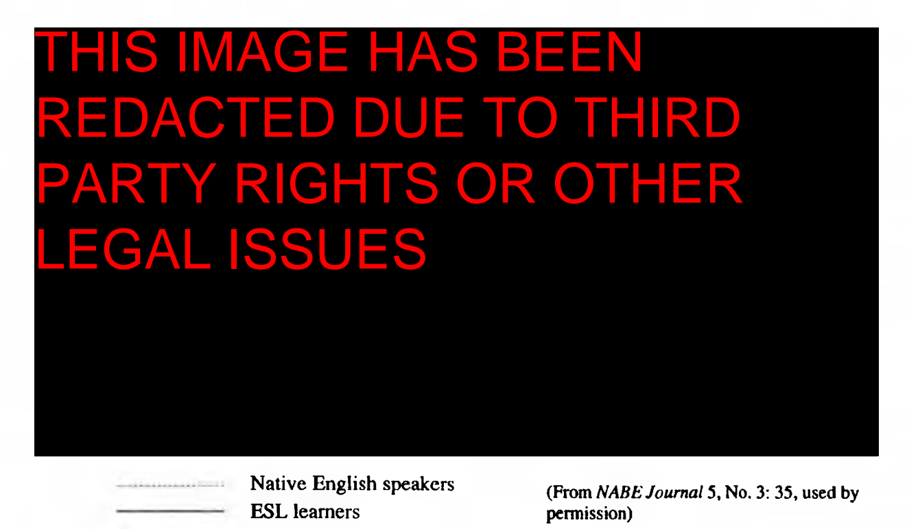
Figure 2 Length of time required to achieve age-appropriate levels of contextembedded and context-reduced communicative proficiency

As shown in Figure 2 [see below], a major reason for this is that native English-speaking students are not standing still waiting for minority language students to catch up with them (op.cit., p. 145).