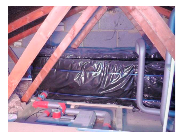
Figure 2: a) insulation missing above ceiling near eaves b) lack of insulation beneath cold water tank.

cold water tank should be brought within the thermal envelope of the dwelling by ensuring the jacket around the tank forms a continuous layer and overlaps the insulation at ceiling level [22].