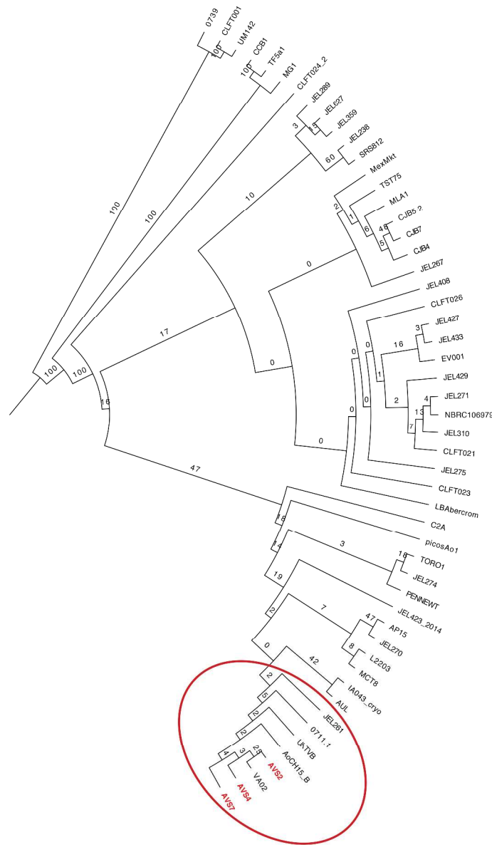
Figure 2. A phylogenetic tree of Bd isolates with proportional branch lengths, based on a 1.66Mb region of supercontig_1.2. This region includes a known loss of heterozygosity (LOH) event shared by all know Bd GPL isolates. The Chilean isolates (labelled in red) form a clade (circled in red) with several isolates from Europe (0711.1, AoCH15, UKTVB and VA02), and one from Canada (JEL261). The branch labels indicate bootstrap support from 500 bootstrap replicates.

1 2 3 4 5 6 7 8 9 10 11 12 13 14 15 16 17 18 19 20 21 22 23 24 25 26 27 28 29 30 31 32 33 34 35 36 37 38 39 40 41 42 43 44 45 46 47 48 49 50 51 52 53 54 55 56 57 58 59 60