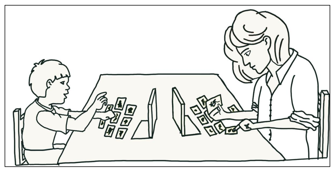
Figure 1. Experimental set-up for the Referential Communication task.

mouse and an elephant in different scenarios. Cartoons were presented one at a time to parents on a laptop, and they were asked to re-tell the story to their child, who had not seen the video (McNeill, 1992). Videos were shown once and no specific instructions regarding story re-telling or using gesture were given. Children were asked to listen to their parent tell the story and were given no further instructions. The order of presentation was counterbalanced across participants.