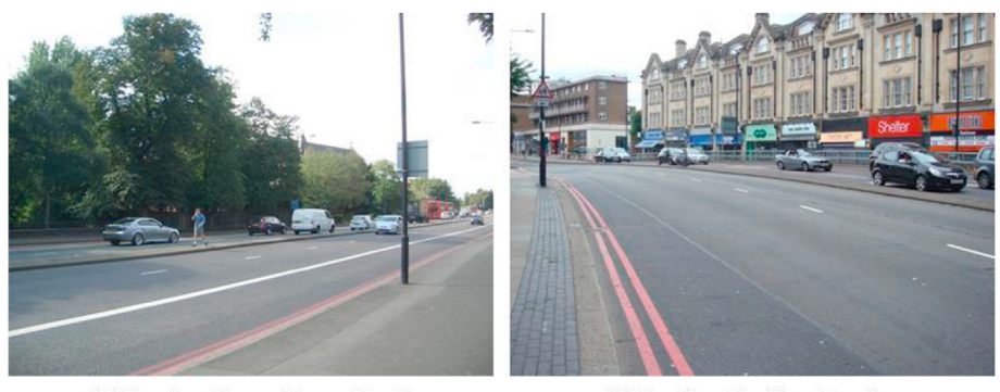
(a) London Seven Sisters Road