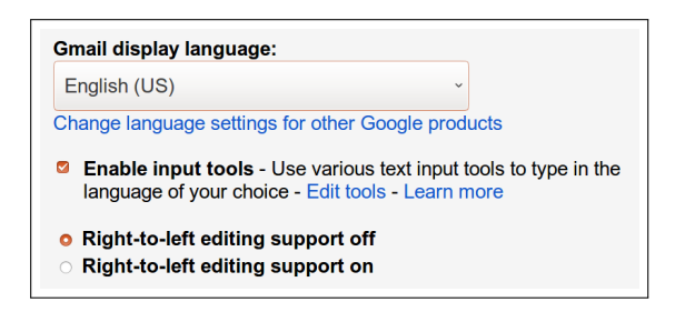
Figure 1: Gmail gives users the option to change the display language of its user interface. In addition to populating the honey accounts with language-specific newsletters, we also changed the display language of each account to match its contents.

Sensitive emails. In fifteen out of thirty honey accounts, we hid fake online banking information. The idea was to mimic the behavior of webmail users that store sensitive information in their accounts. To achieve this, we created screenshots of fake bank account details and online banking pages (see Figures 2 and 3), and sent emails containing those screenshots to the honey accounts themselves. For each honey account h_G designated to contain sensitive information, we sent the screenshots described earlier from h_G to itself. We used region-specific bank information while seeding the accounts,