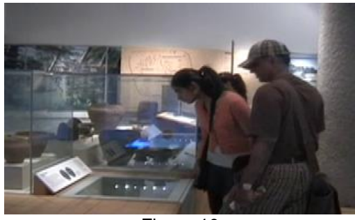
Figure 10