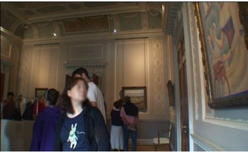
Figure 19

Interestingly enough, throughout this small interaction, D has not said anything at all. Instead, she has been constantly confirming her attendance by being physically present and in close proximity to M, following his indications and listening to him. Moreover, D has not only been drawn to and away from the painting by her co-visitor's performance, but has also seen the painting in the light of his performance; that is, she has seen the painting in very specific ways (i.e. squinting and stepping backwards). This on-going and embodied acknowledgment of her co-visitor may be seen as indicative of their relationship status, their social bonds, which also shape their encounter with the exhibit. This may be also related to one of Falk's visitors' identities (2009), the facilitator, which refers to those visitors coming to the museum on behalf of others' special interests in the exhibition or the subject-matter of the museum.