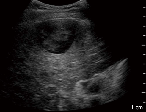
Figure 1 Contrast-enhanced ultrasound performed after 1 mo in a 71-year-old man treated with trans-catheter arterial chemo-embolisation: On the left side complete necrosis is depicted as an avascular area; on the right side B-mode imaging of the treated area.