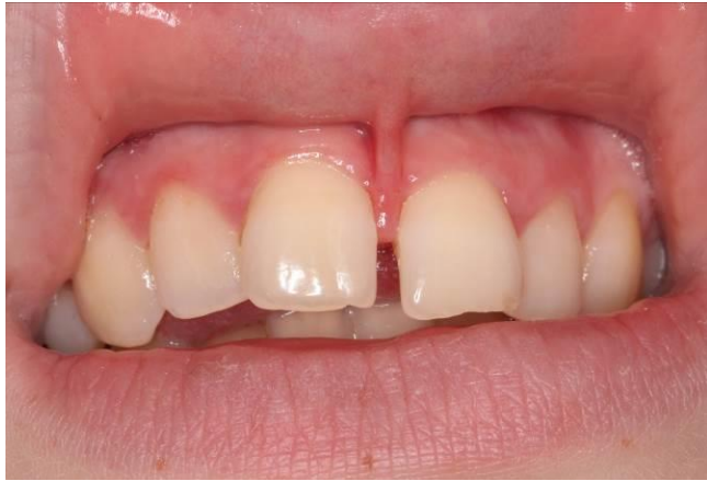
Figure 2. A low lying labial frenum.