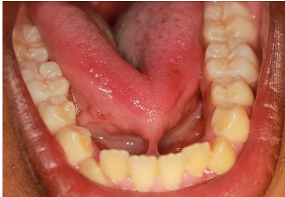
Figure 3. A tongue-tie.

Role of the GDP: The GDP can diagnose tongue ties and reassure parents of the diagnosis. If there are feeding concerns with infants an onward referral is indicated.