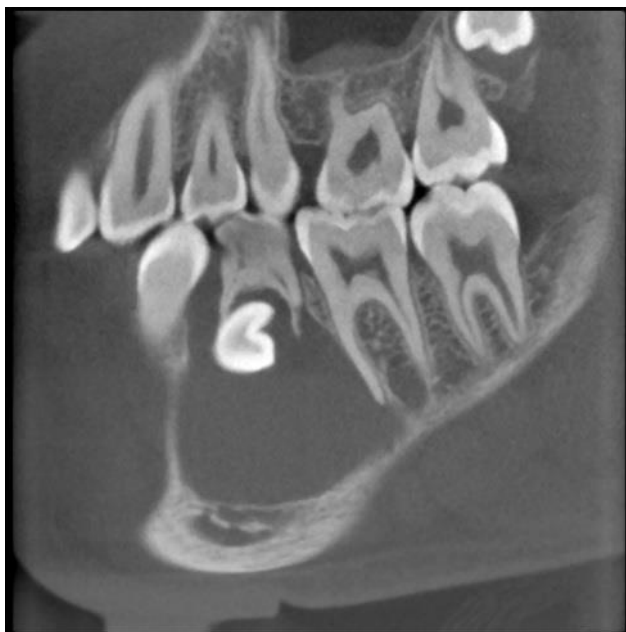
Figure 4. A sagittal section of a CBCT image showing a dentigerous cyst associated with the lower right second premolar.

Role of the GDP: The GDP may be the first clinician to suspect a dentigerous cyst following a clinical and radiographic examination. If a cyst is suspected the patient should be referred to secondary care for a further assessment and for management of the cyst.