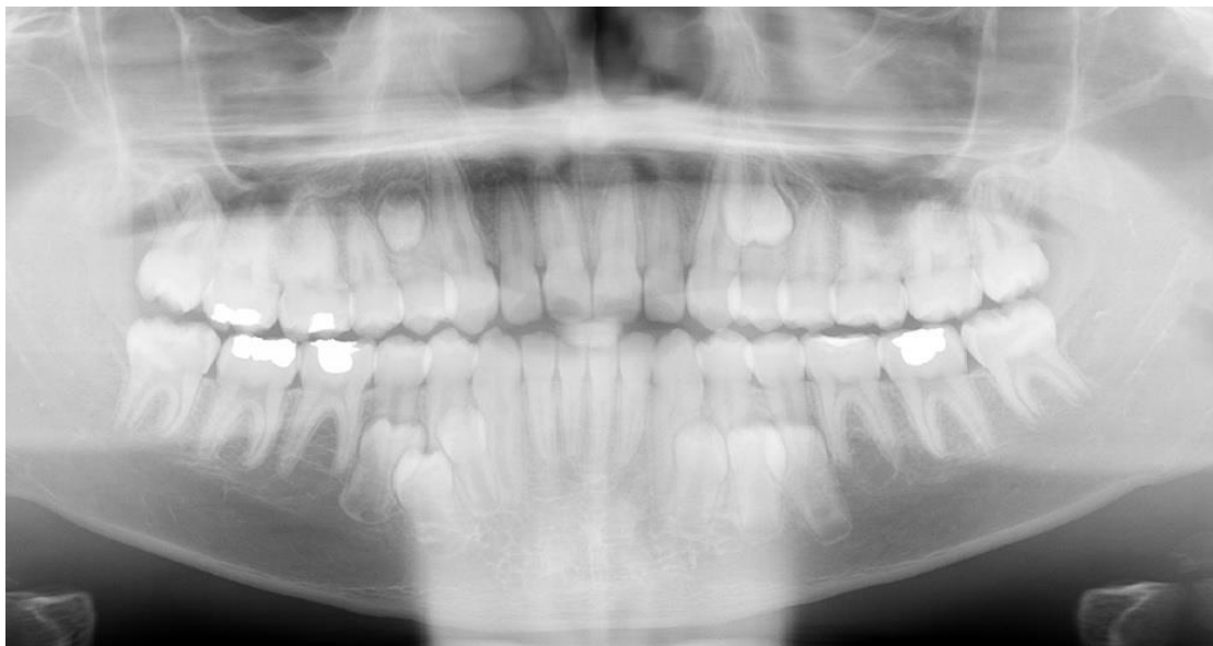
Figure 5. A DPT showing the presence of supplemental premolars in all quadrants.