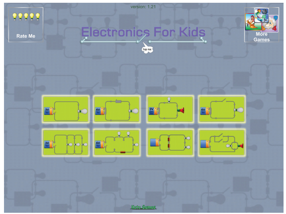
Figure 2. The home screen of 'Electronics for Kids'.