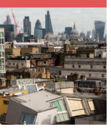
Figure 2: Information on Bethnal Green Library on the Layers of London website: data contributed by Tower Hamlets Council and Historic England.

'Layers of London' – a rich geographical palimpsest