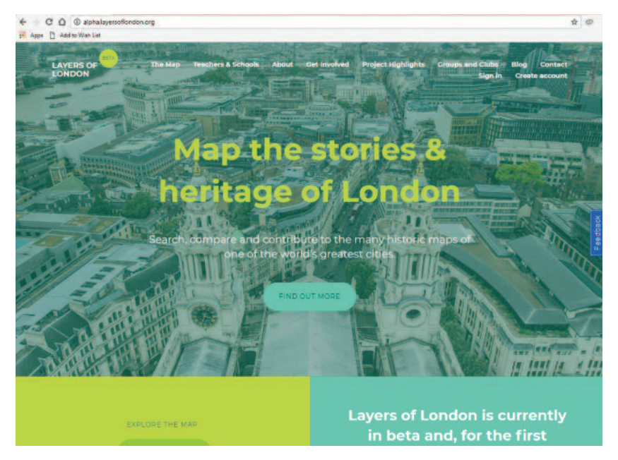
Figure 1: The Layers of London project homepage.

'Layers of London' – a rich geographical palimpsest