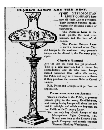
5 An early illustrated advertisement in the Jewish Chronicle, 18 October 1850, 16.

world, its principal attraction was the copious illustrations of the people, places, and events in the news. This popular weekly soon achieved a circulation of some 60,000 copies. However, illustrations required artists and engravers and such materials as wood or copper plates, which added to the cost of a periodical. Small-circulation publications that were barely viable financially could not afford extensive illustrations.