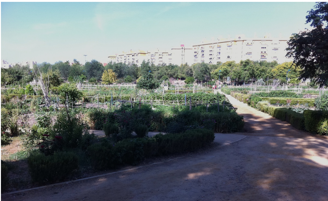
Figure 6. Parque Miraflores, Seville.