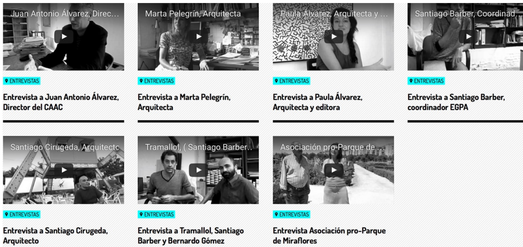
Figure 3. Selection of clips from interviews to local agents.