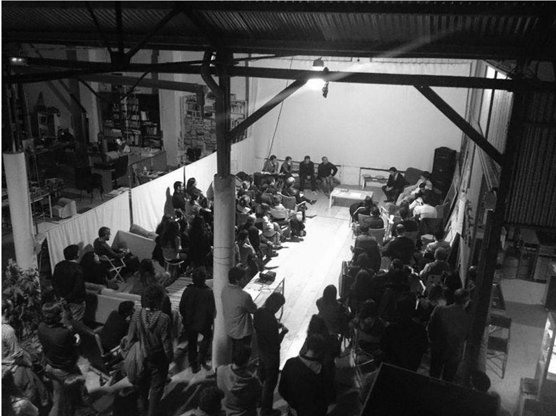
Figure 5. Public engagement event in Tramallol, November 2012, Seville.