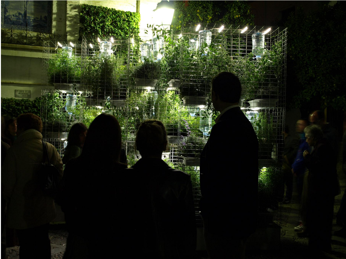
Figure 7. M1ML.