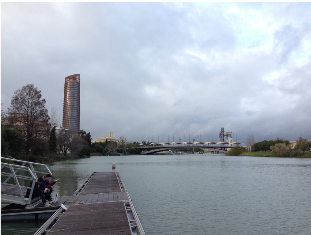
Figure 2. View of “Torre Sevilla” from the Guadalquivir River, photograph by author.