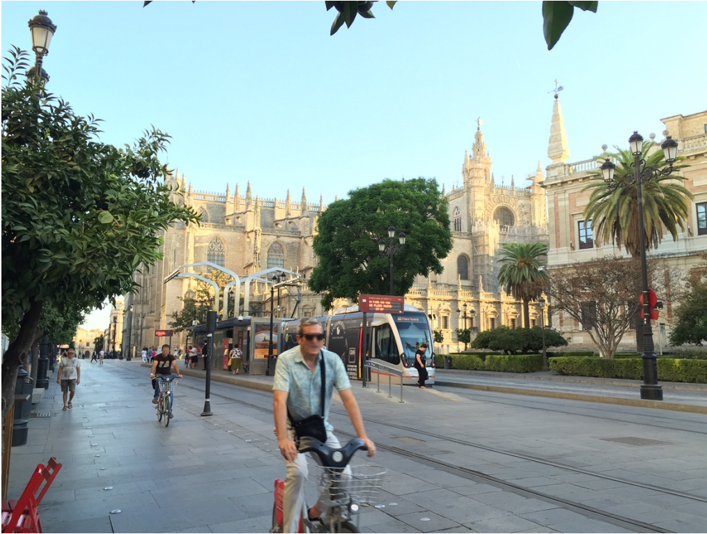
Figure 1. Pedestrianised Constitución Avenue and tram (metrocentro).